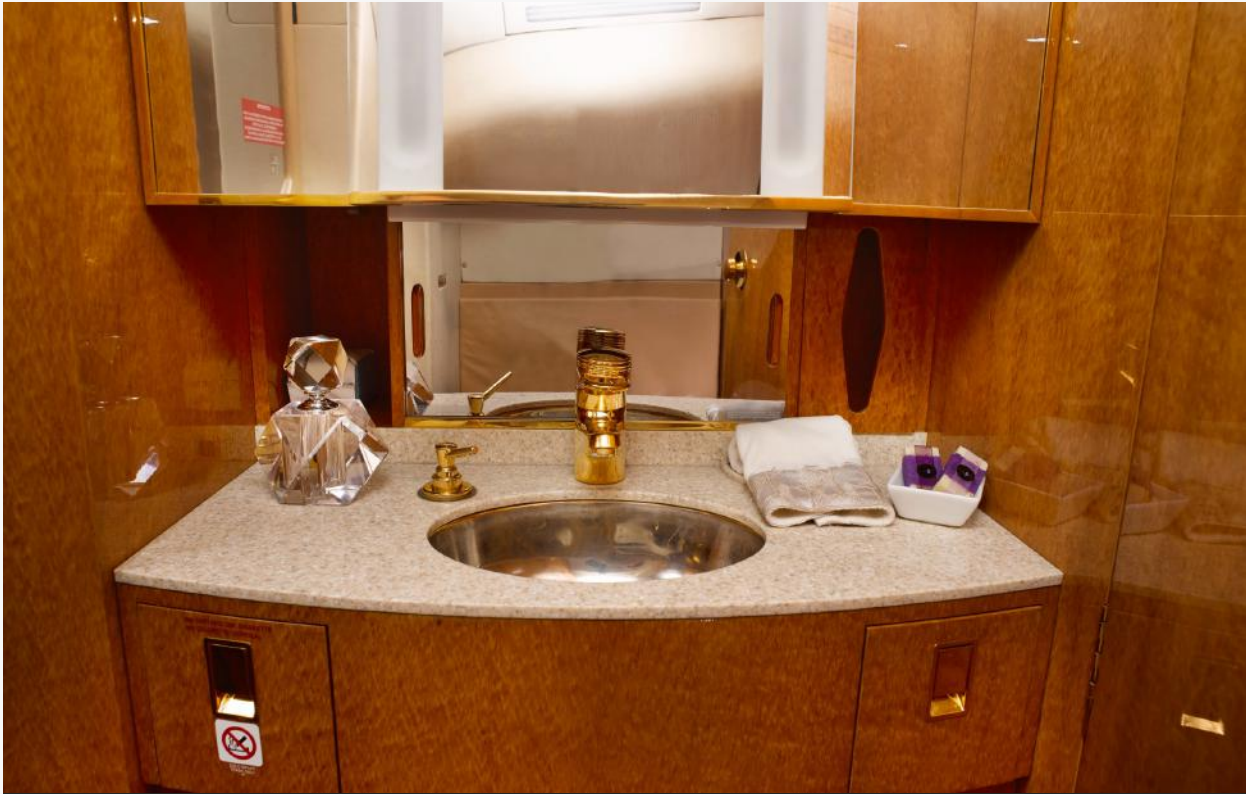
Aft Lav Vanity