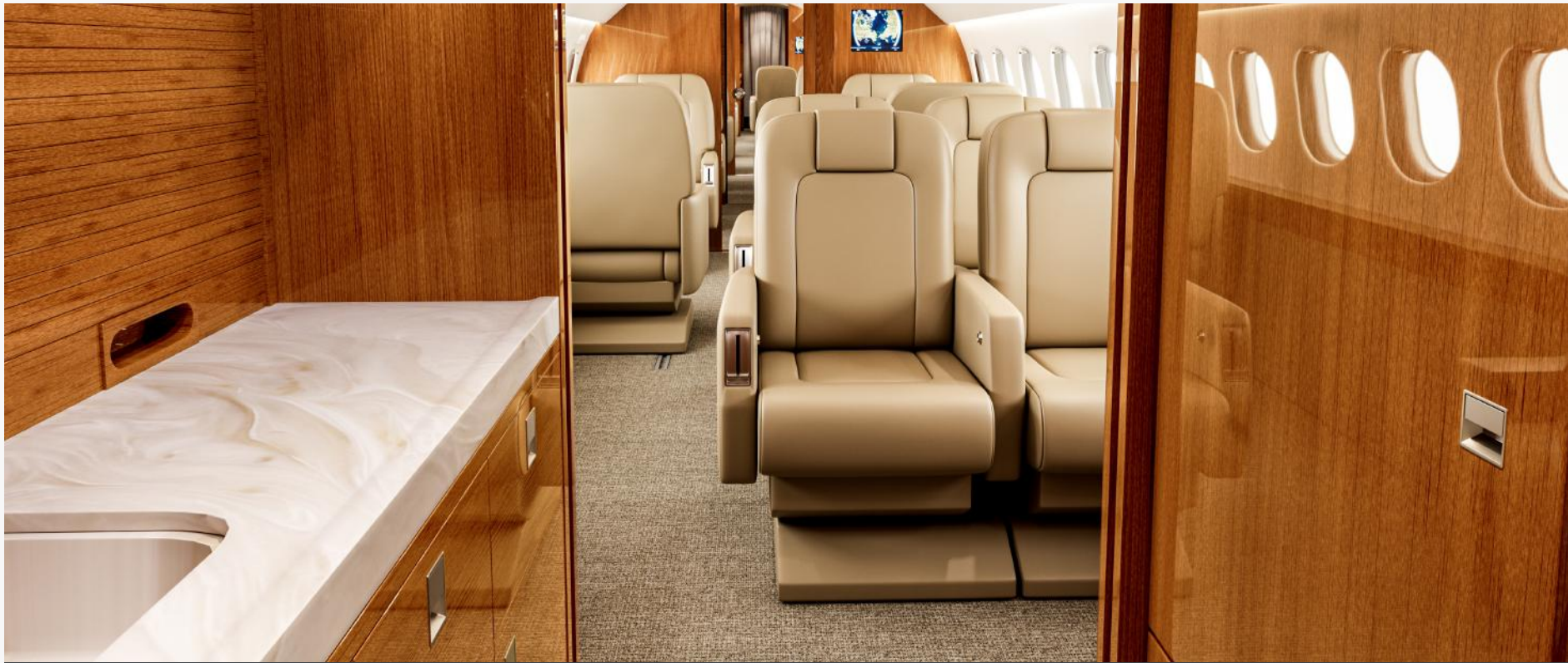
Rendering of Forward Right-Hand Galley Looking Aft