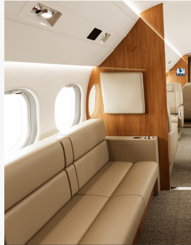
Rendering of Aft Left-Hand Divan Looking Forward