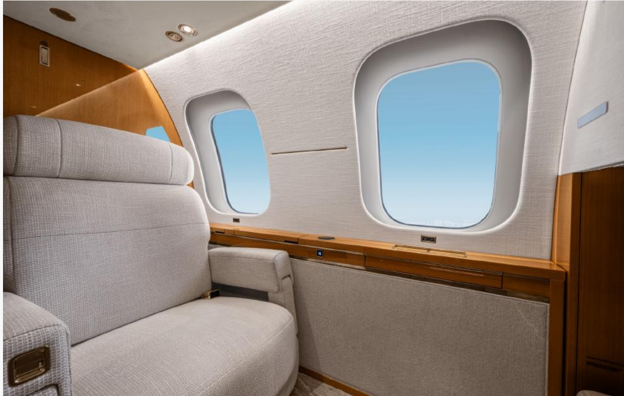
Forward LH Crew Rest Area