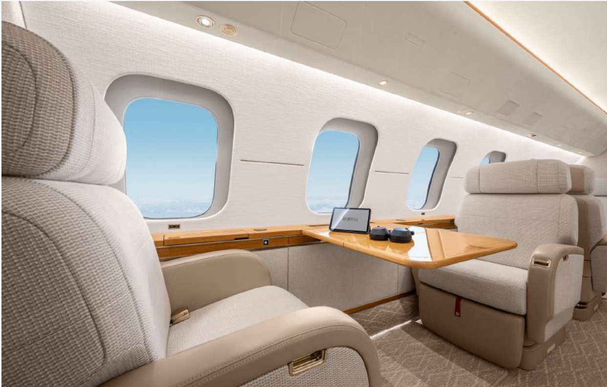
Club Seats with Fold-Out Table