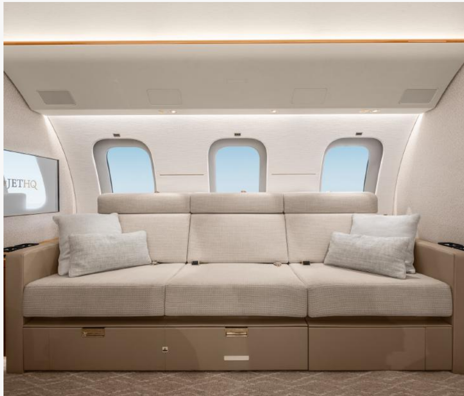
Zone 4 Three-Place Divan