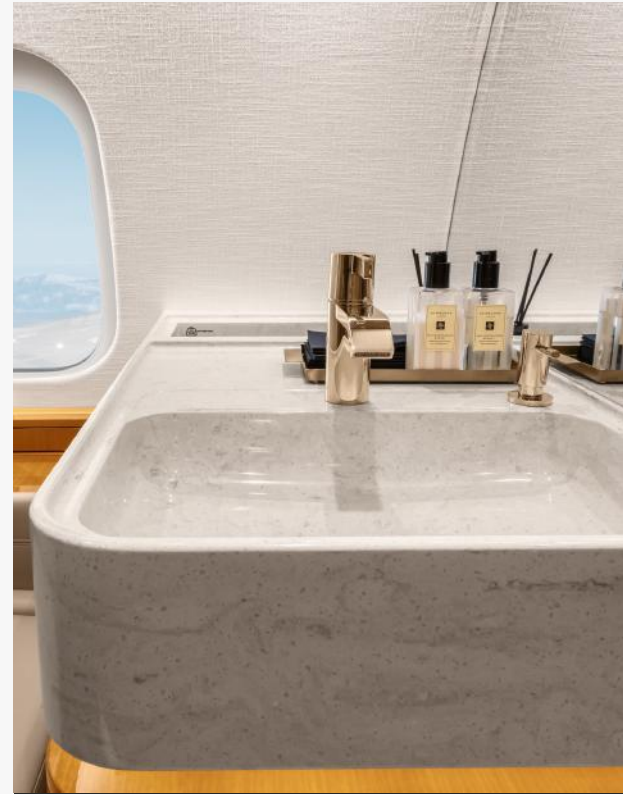
Aft Lavatory Sink