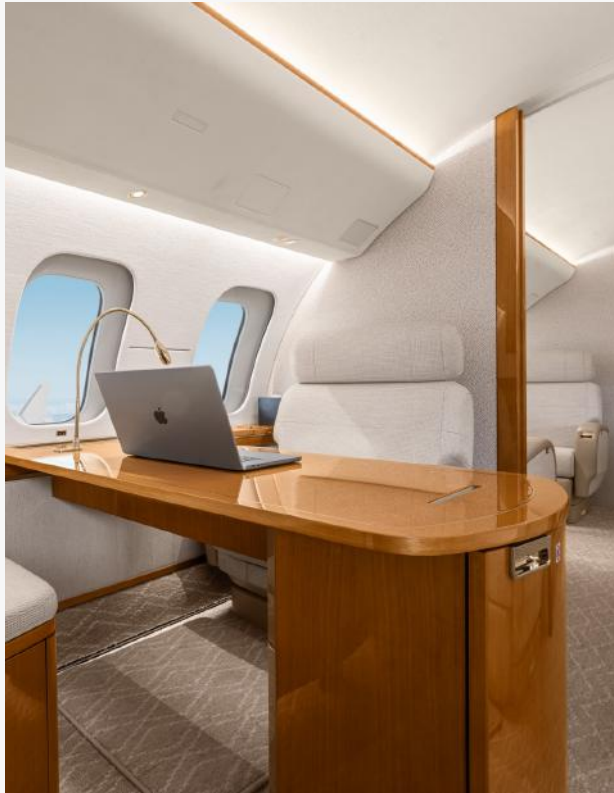
Zone 3 Work-Station