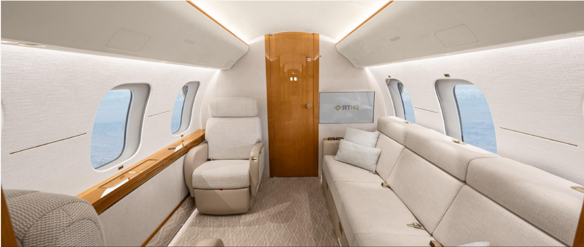
Zone 4 Facing Aft