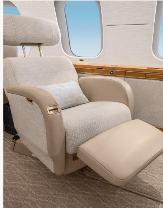
Bombardier Nuage Seat (Extended)