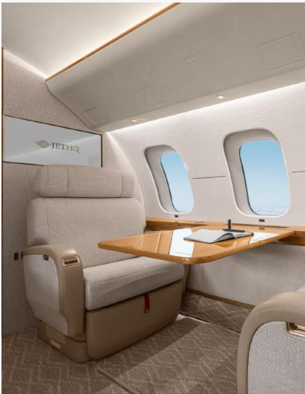
Club Seats with Fold-Out Table