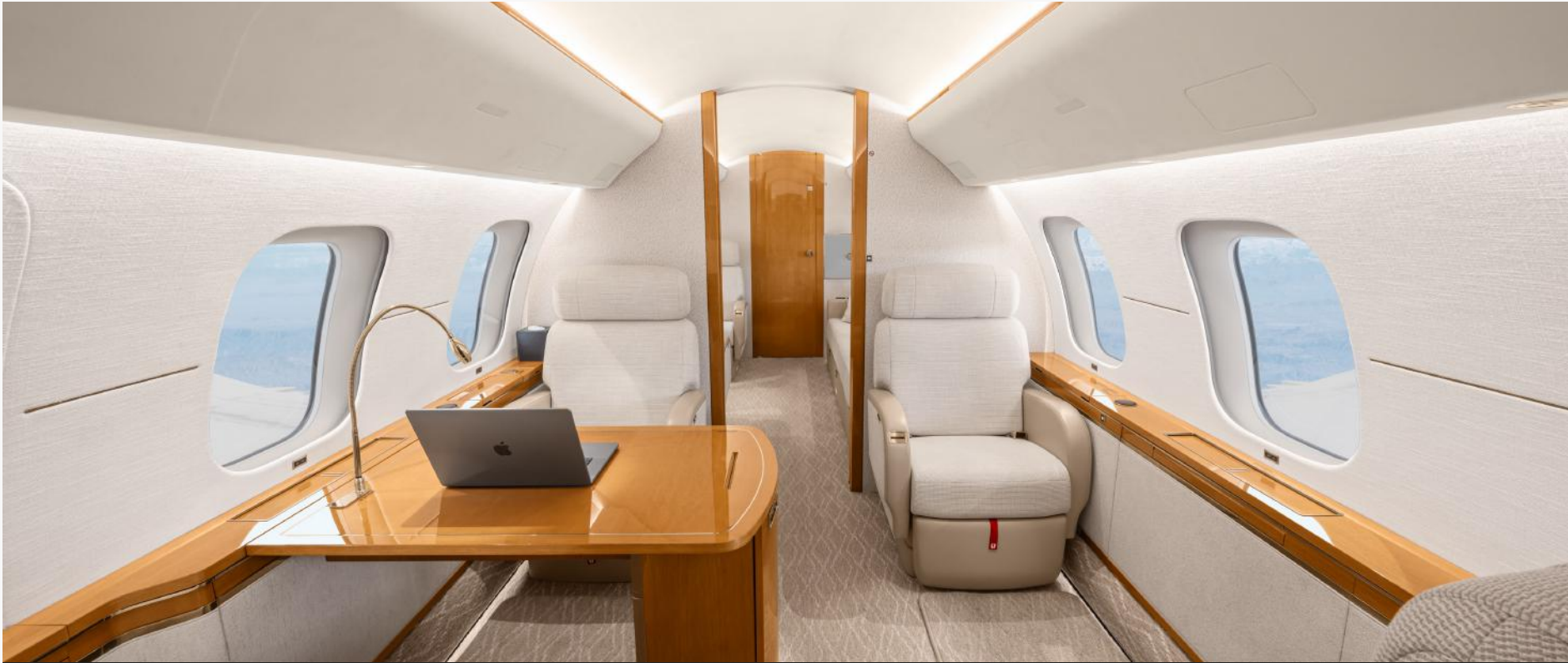
Zone 3 Facing Aft