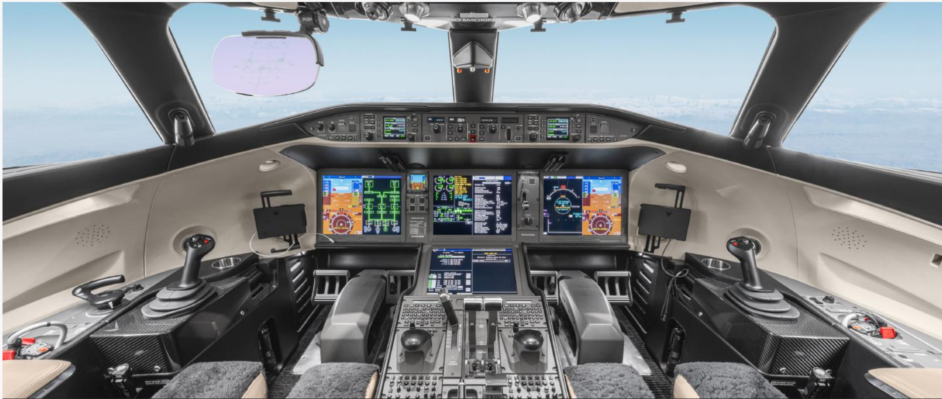
Collins Pro Line Fusion (Bombardier Vision)