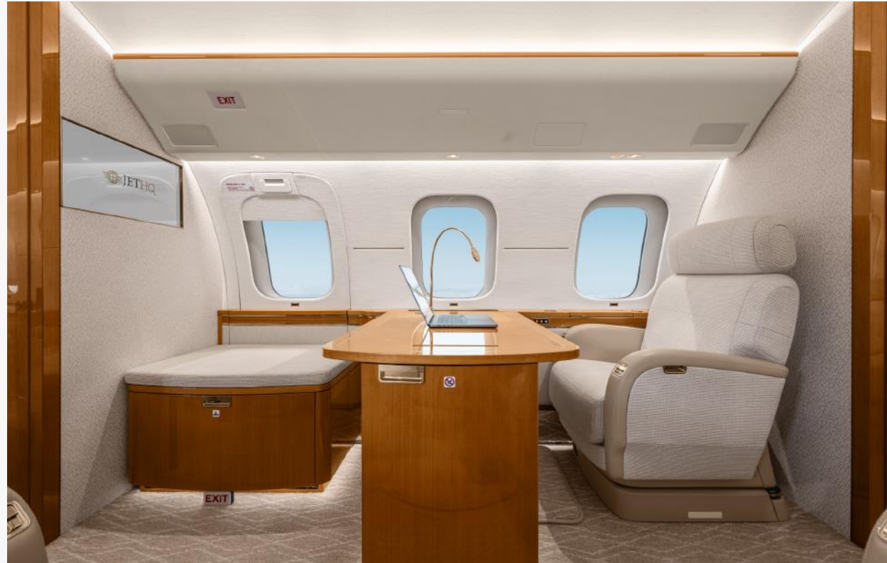
Zone 3 Work-Station