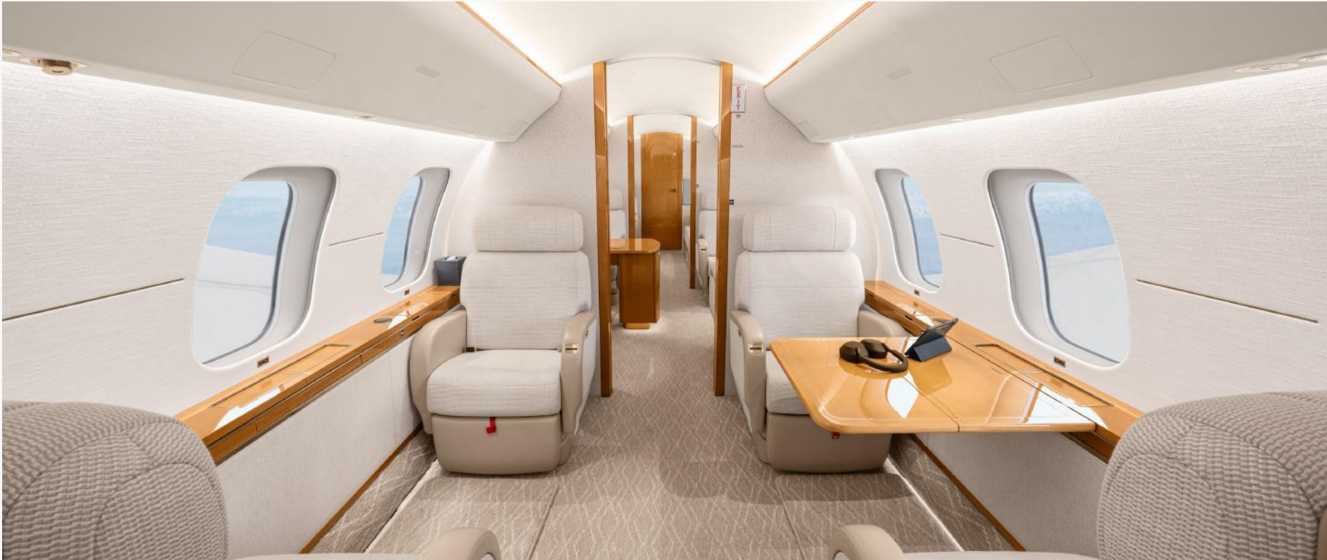
Zone 2 Facing Aft