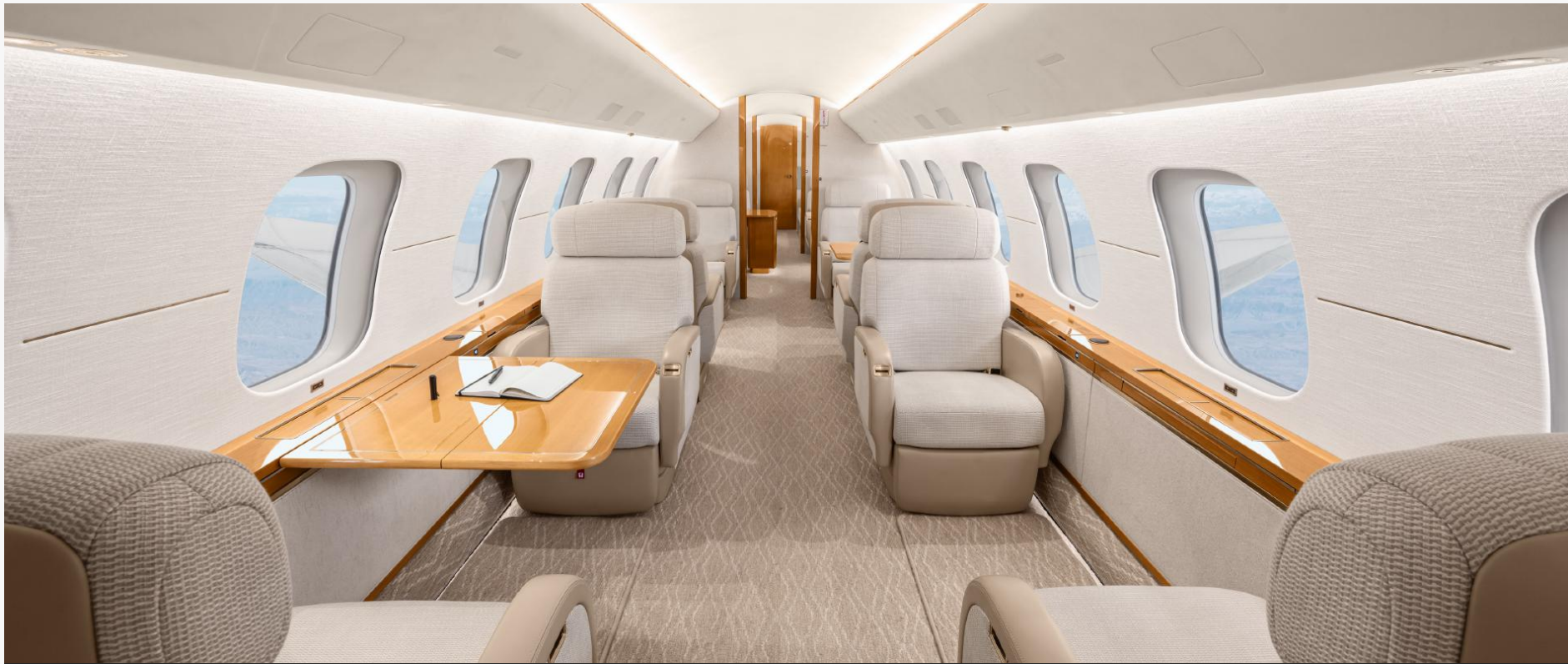
Zone 1 Facing Aft