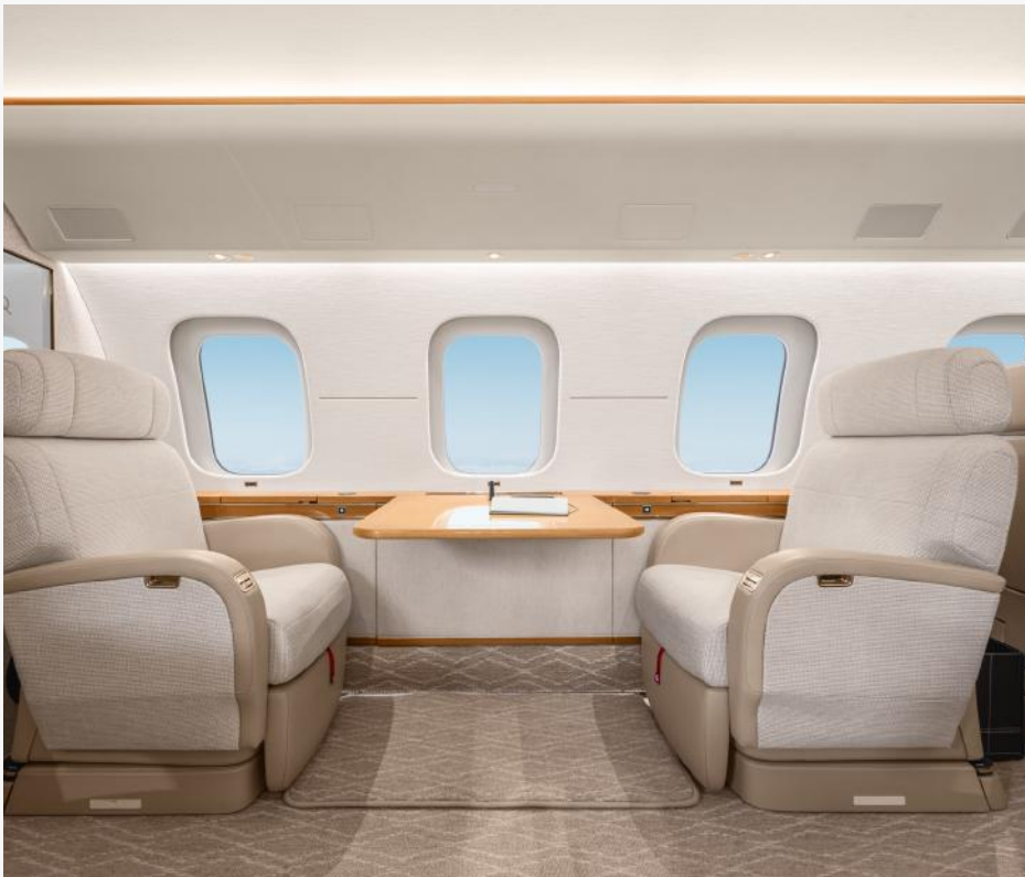
Zone 4 Two-Place Club with Fold-Out Table