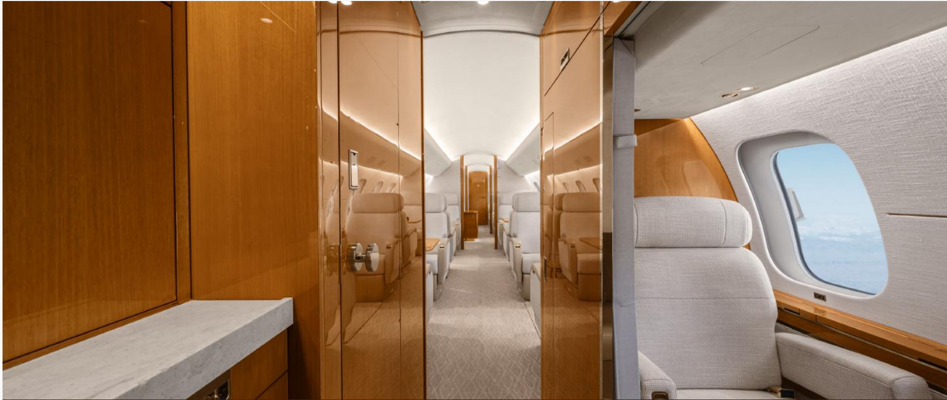
Forward Galley & Crew Rest Area