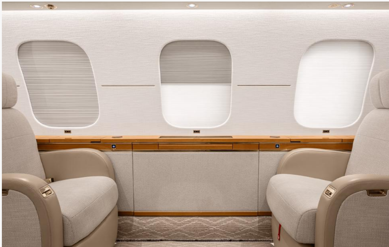
Cabin Window Shades