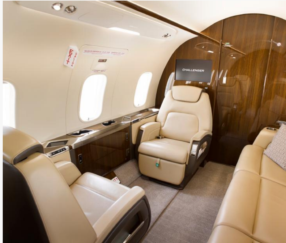
Aft Two-Place Club & Three-Place Divan