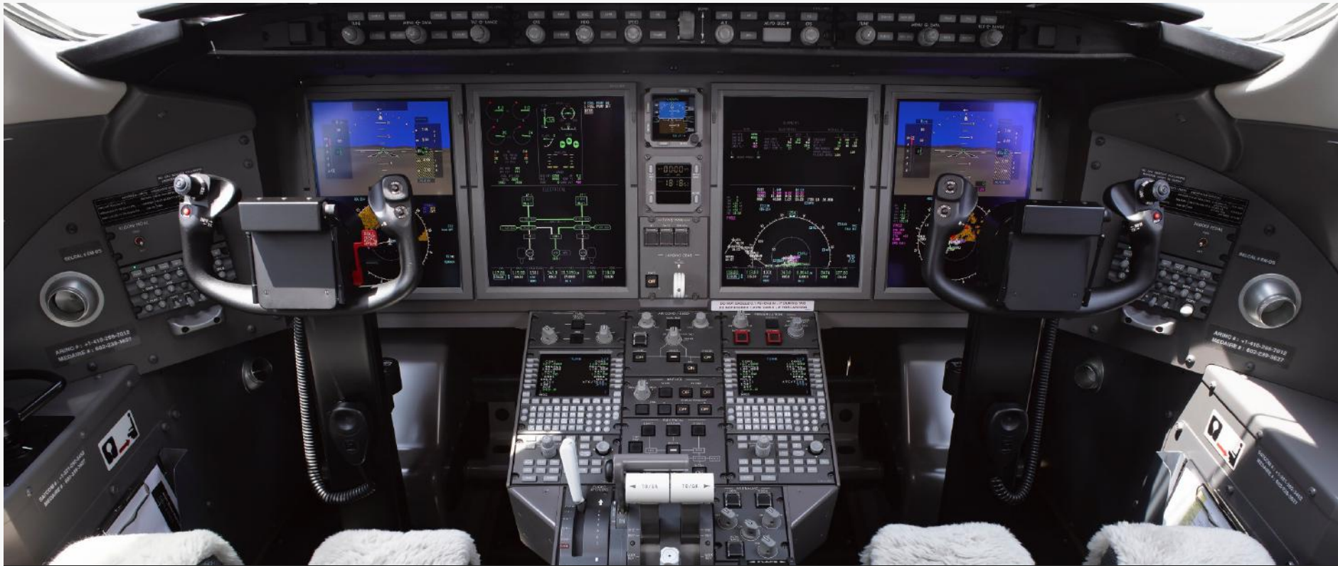
Collins Pro Line 21 Advanced Avionics Suite