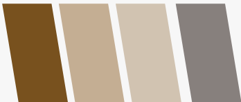
Displayed color swatches are an approximation