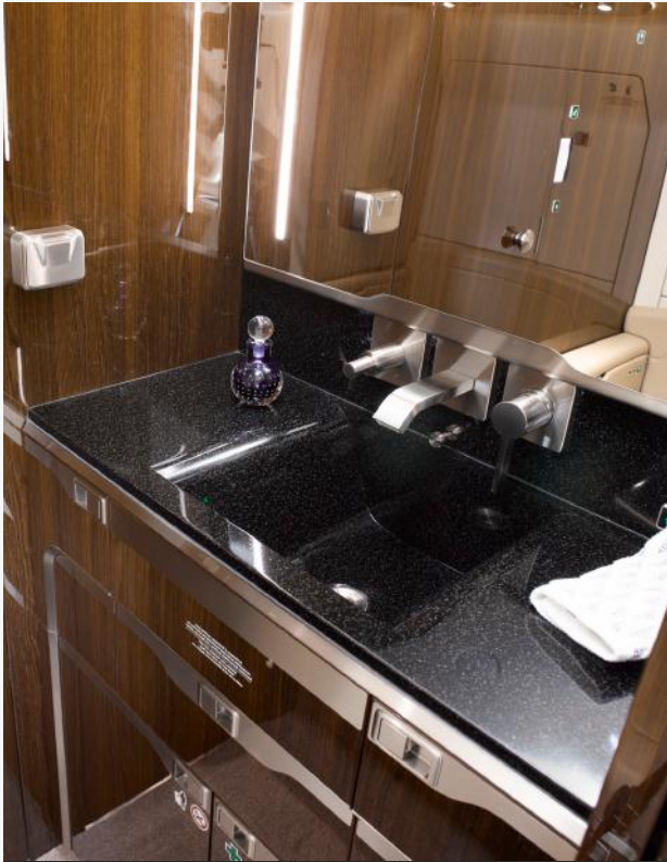
Aft Executive Lavatory