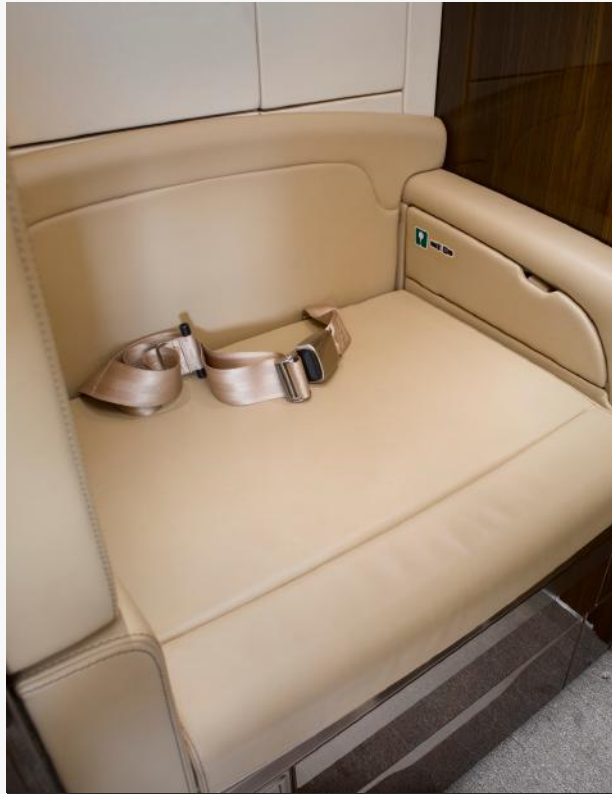
Belted Lavatory Seat