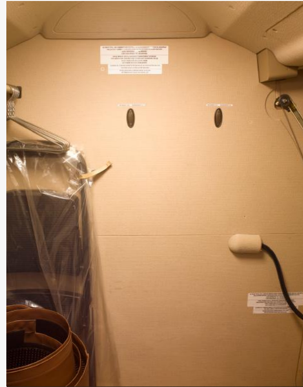
In-Flight Accessible Aft Baggage Area