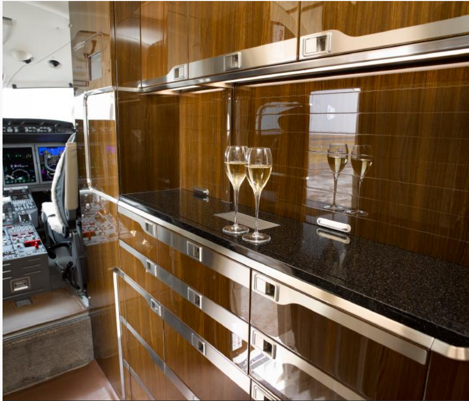
Forward RS Galley Looking Forward