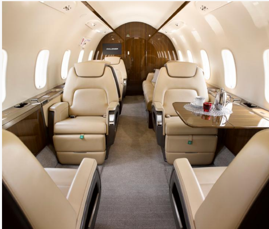
Forward Four-Place Club Seating