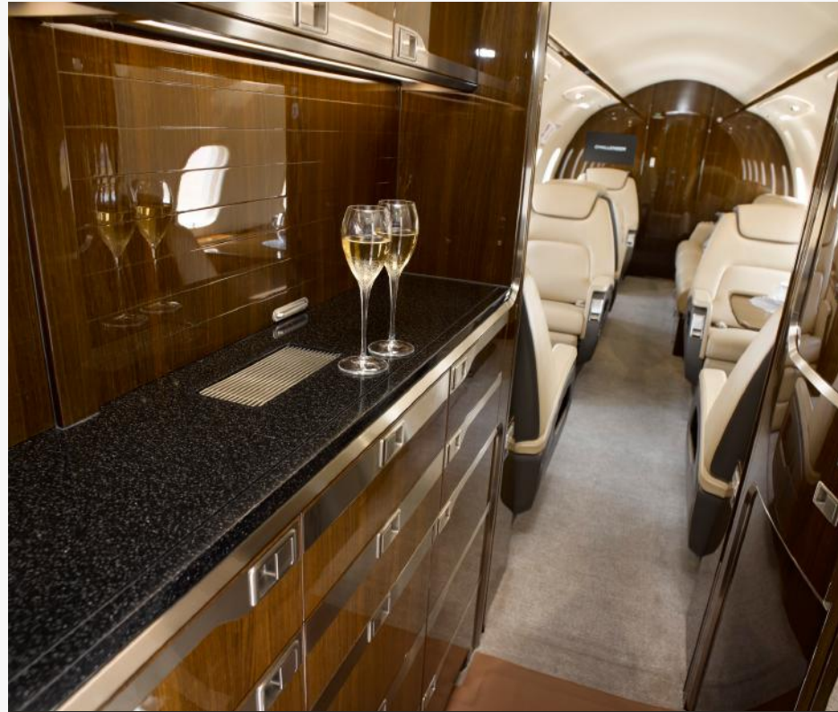
Forward RS Galley Looking Aft