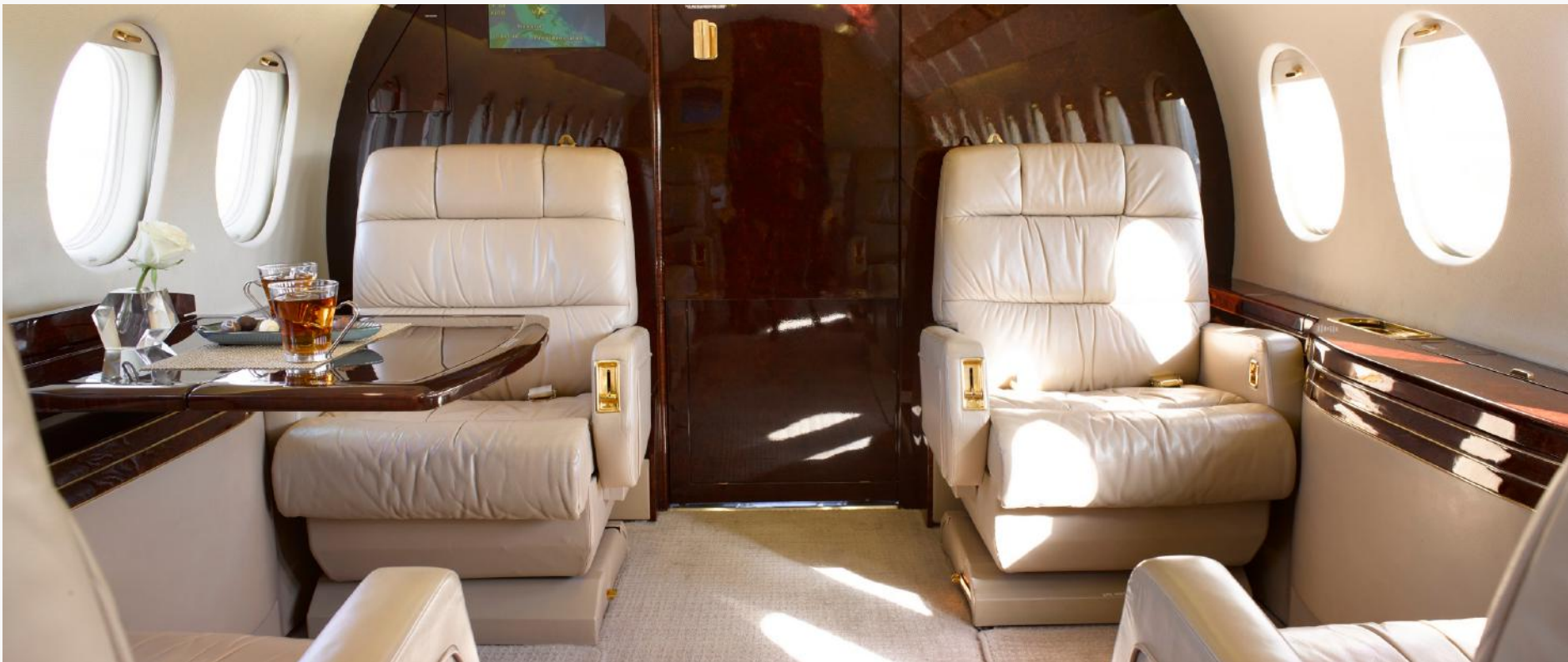
Aft Four (4)-Place Club Facing Aft