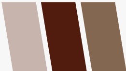
Displayed color swatches are an approximation

Full Size Jump Seat Certified for Take-Off/Landing (for Crew Only)