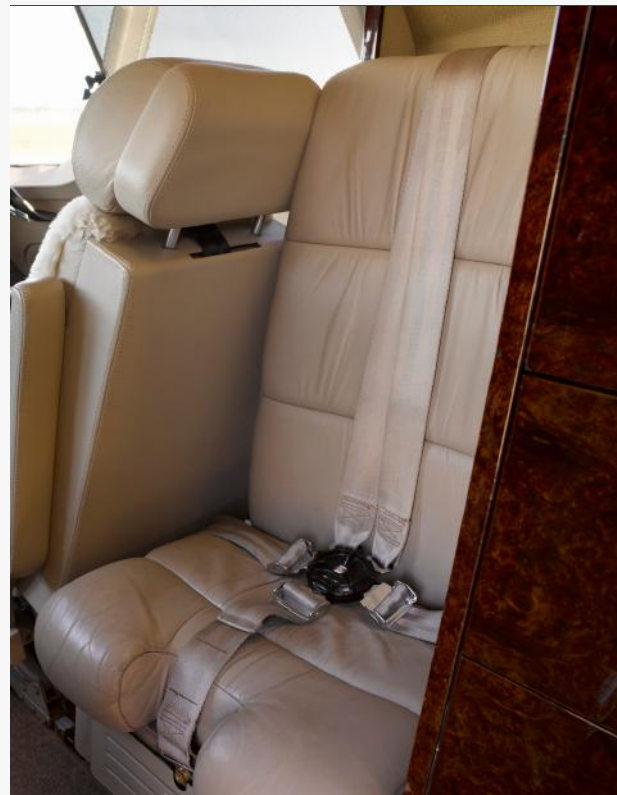
Crew Jump Seat