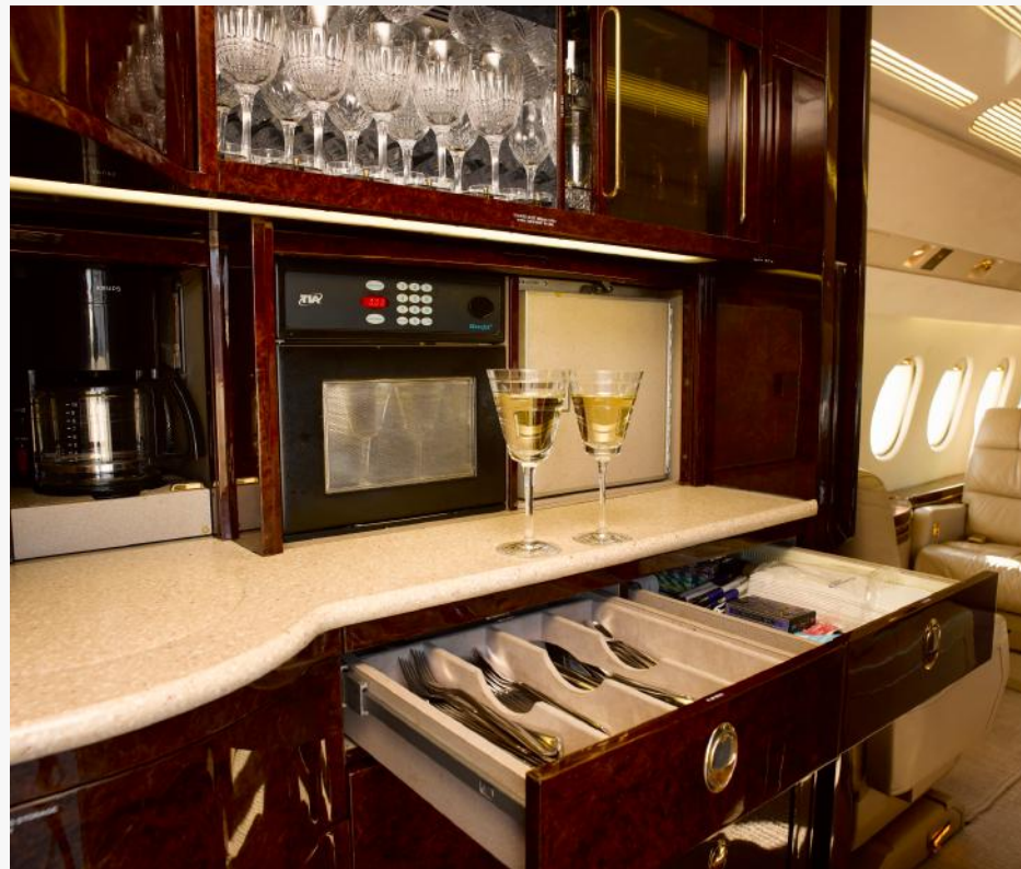
Galley Equipment & Storage