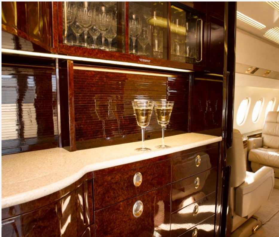
Forward RH Galley