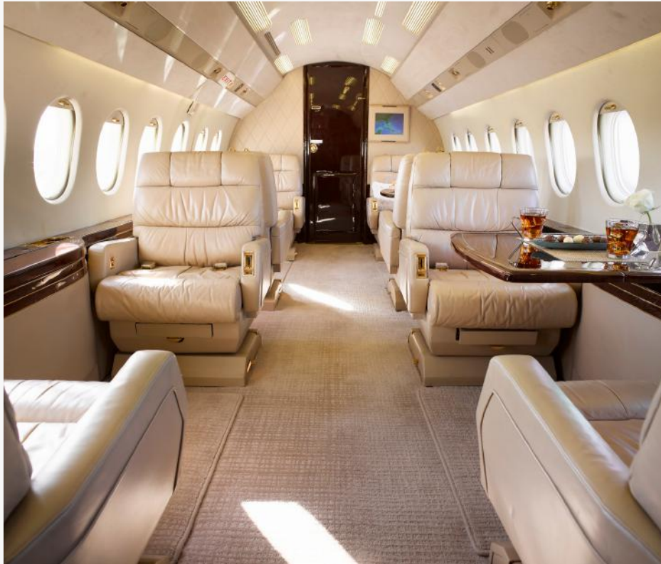
Aft Seating Facing Forward