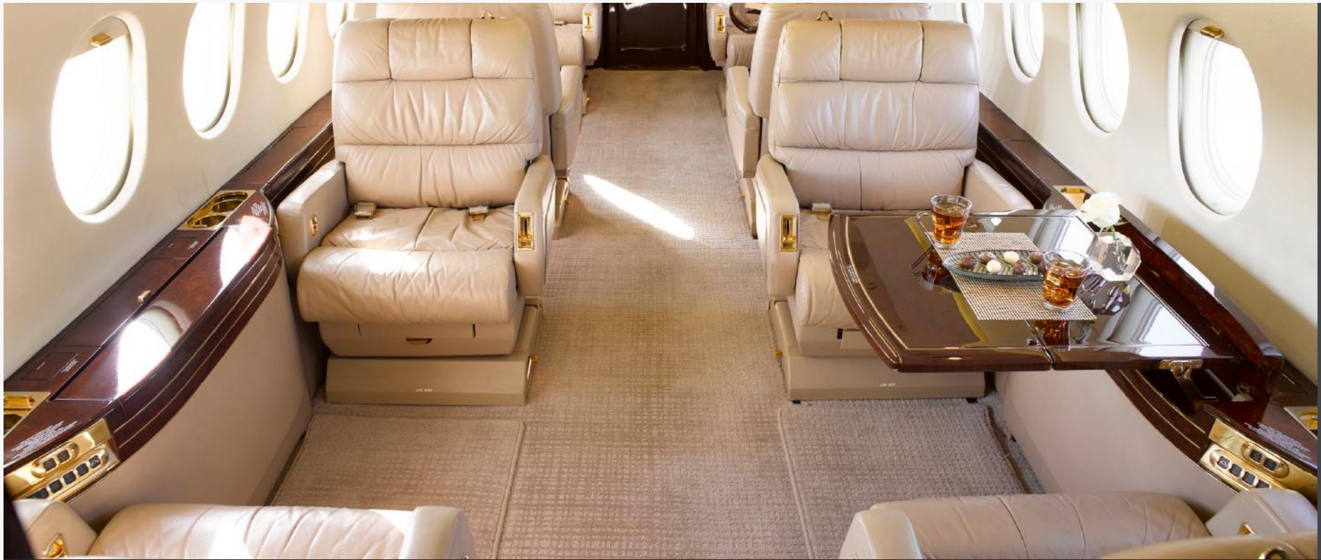
Forward Four (4)-Place Club Facing Aft