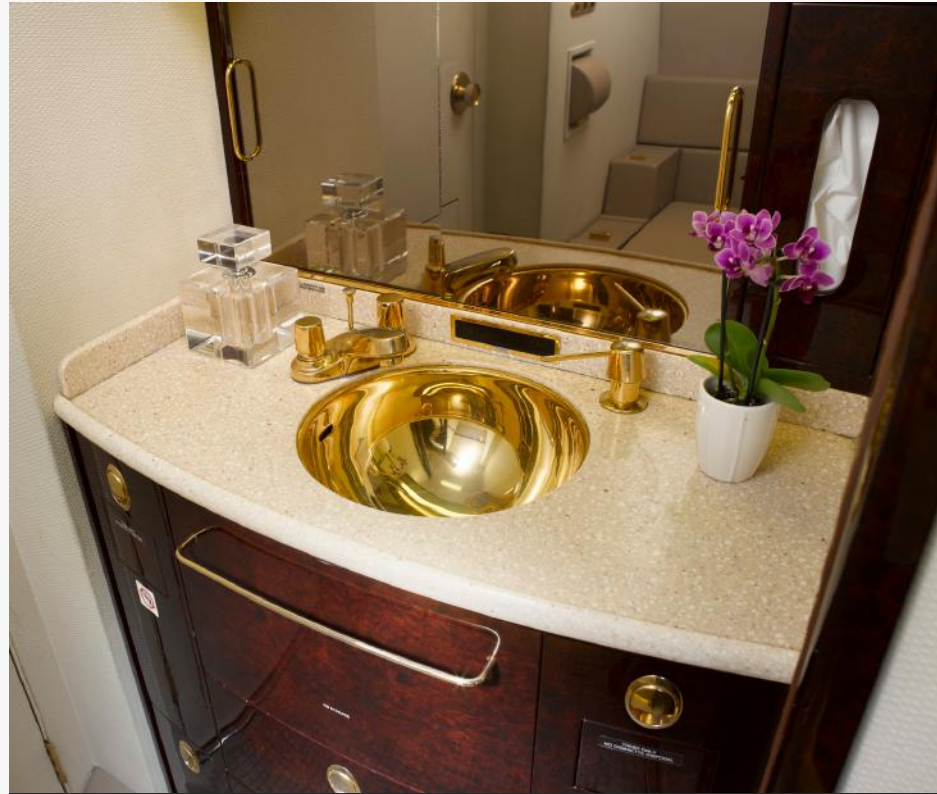
Aft Lavatory Vanity & Sink