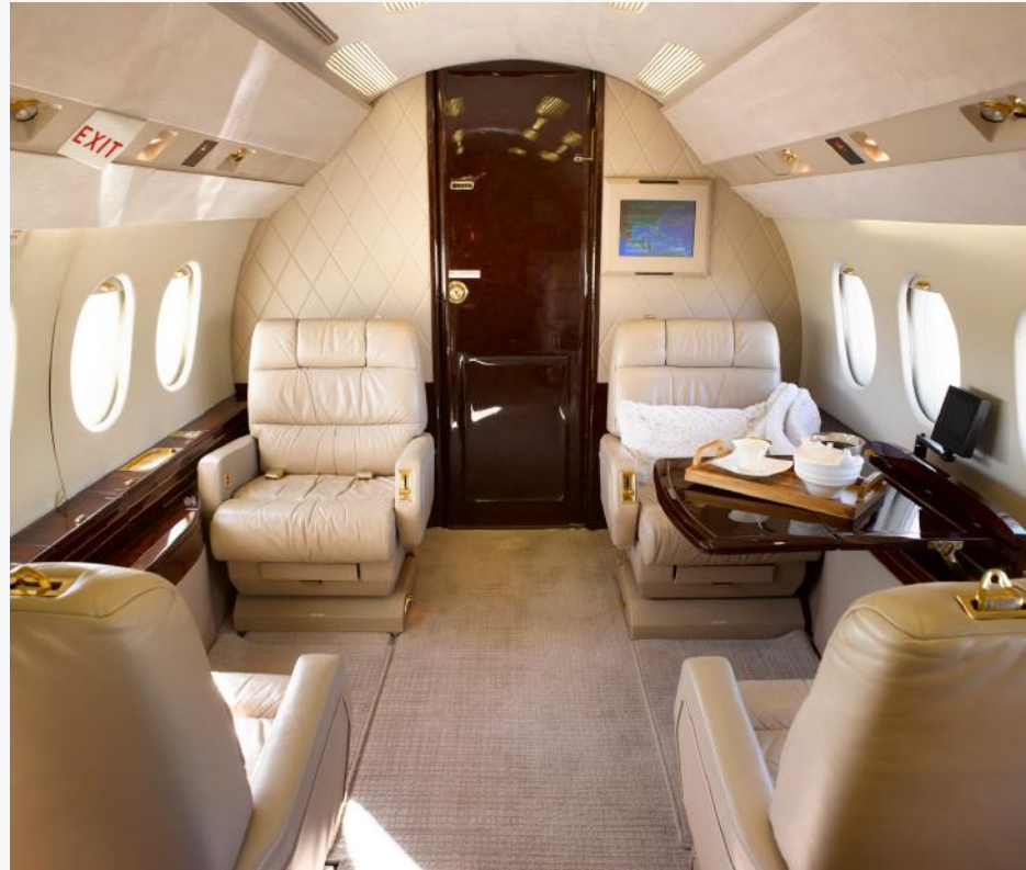
Forward Seating Facing Forward