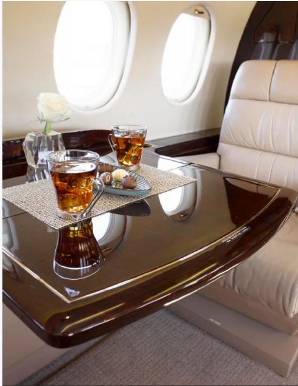
Aft Executive Table Detail