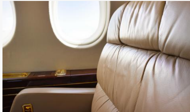
Leather Seat Detail