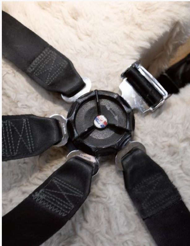
Flight Deck 5-Point Harness