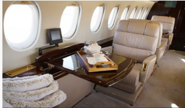
Forward RH Club Seating