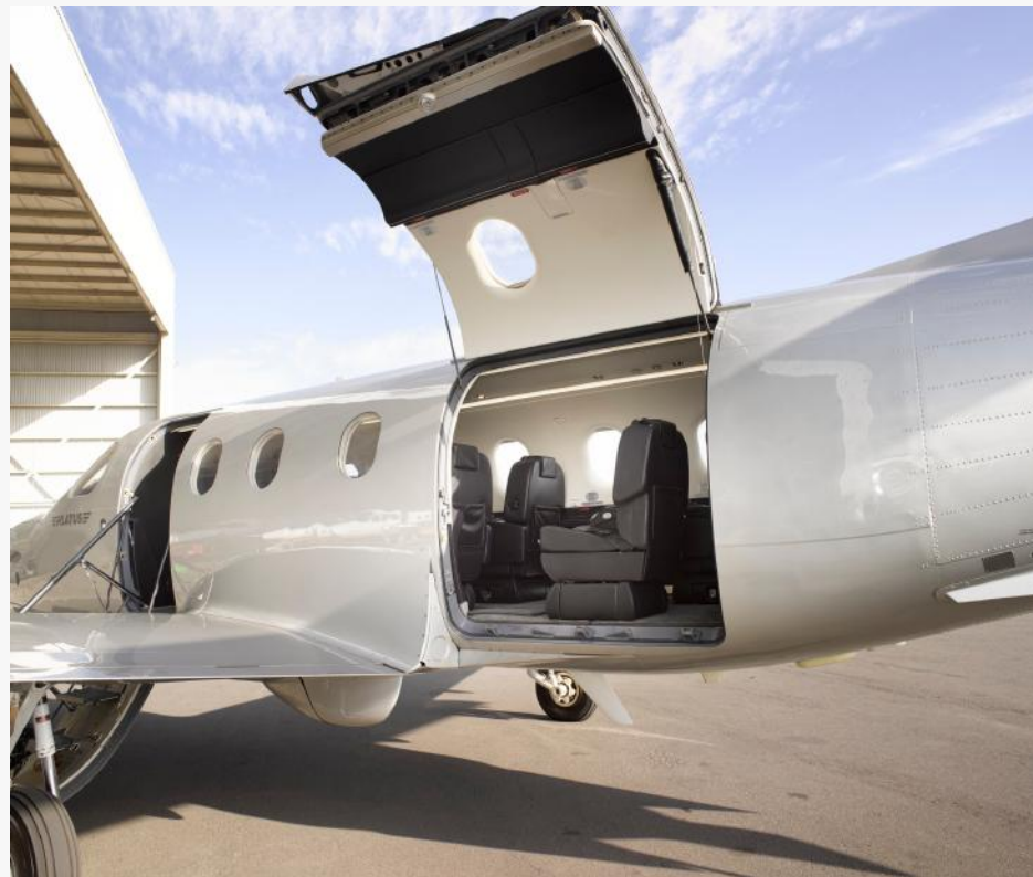
Aft Cargo Door (Open)