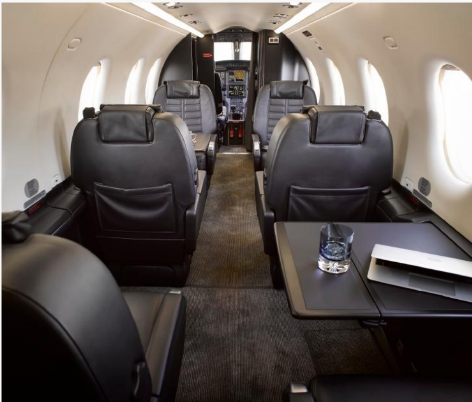
Aft Cabin Facing Forward