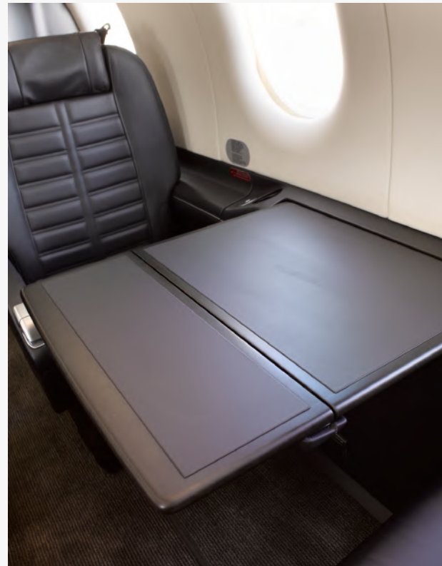
Four-Place Club Table (Fully Extended)