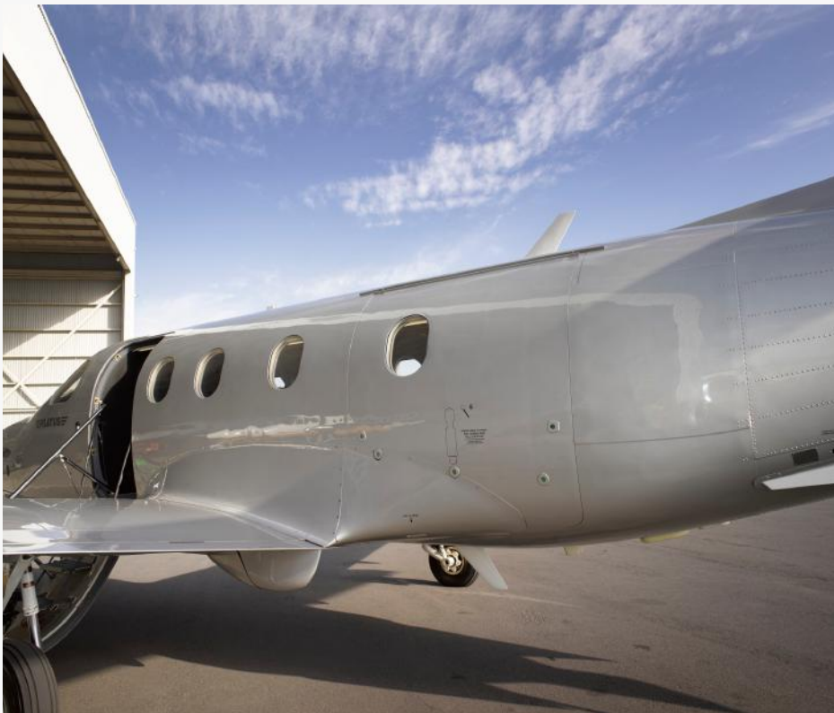
Aft Cargo Door (Closed)