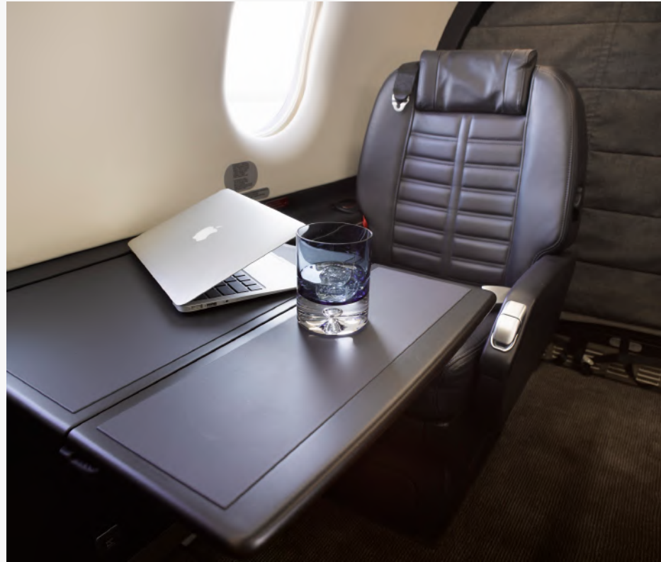
Aft Fwd-Facing Seat Table Detail