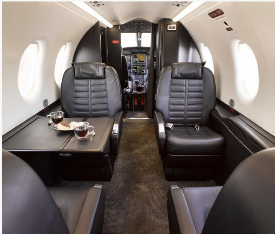
Four-Place Club Facing Forward