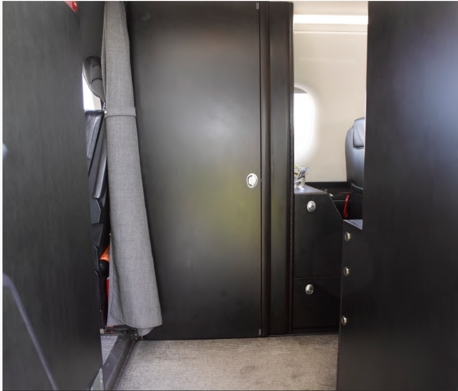
Fwd Lavatory (Door Closed)