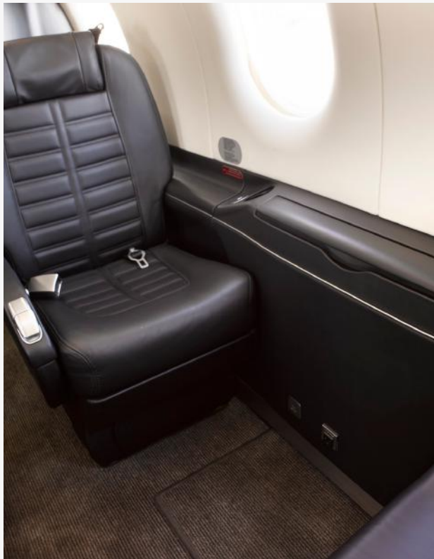
Four-Place Club Table (Stowed)