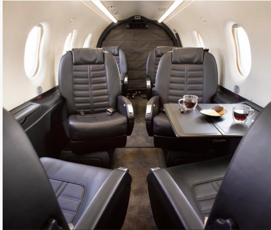
Four-Place Club Swivel Seats