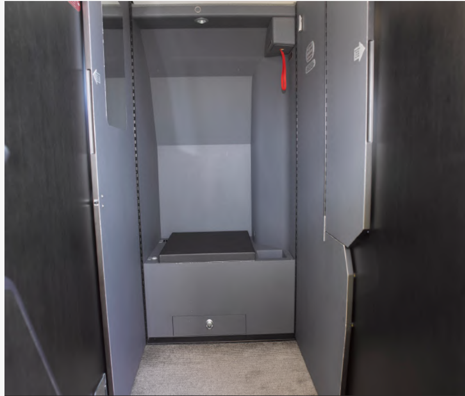
Fwd Lavatory (Pocket Privacy Door Extended)