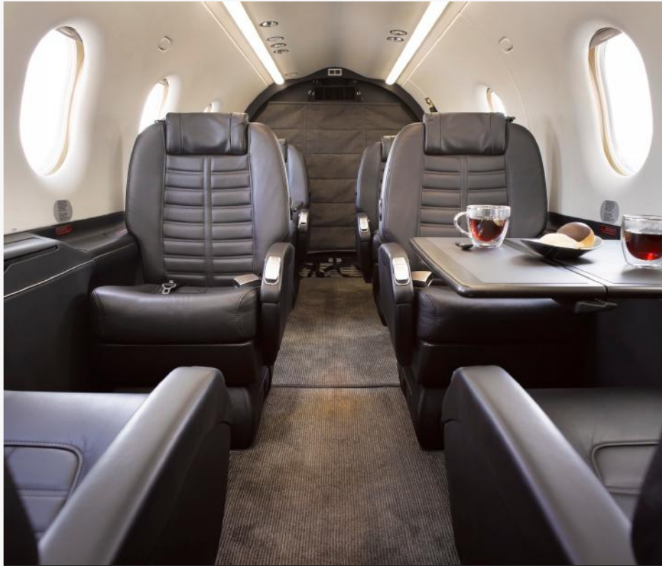
Fwd Cabin Four-Place Club