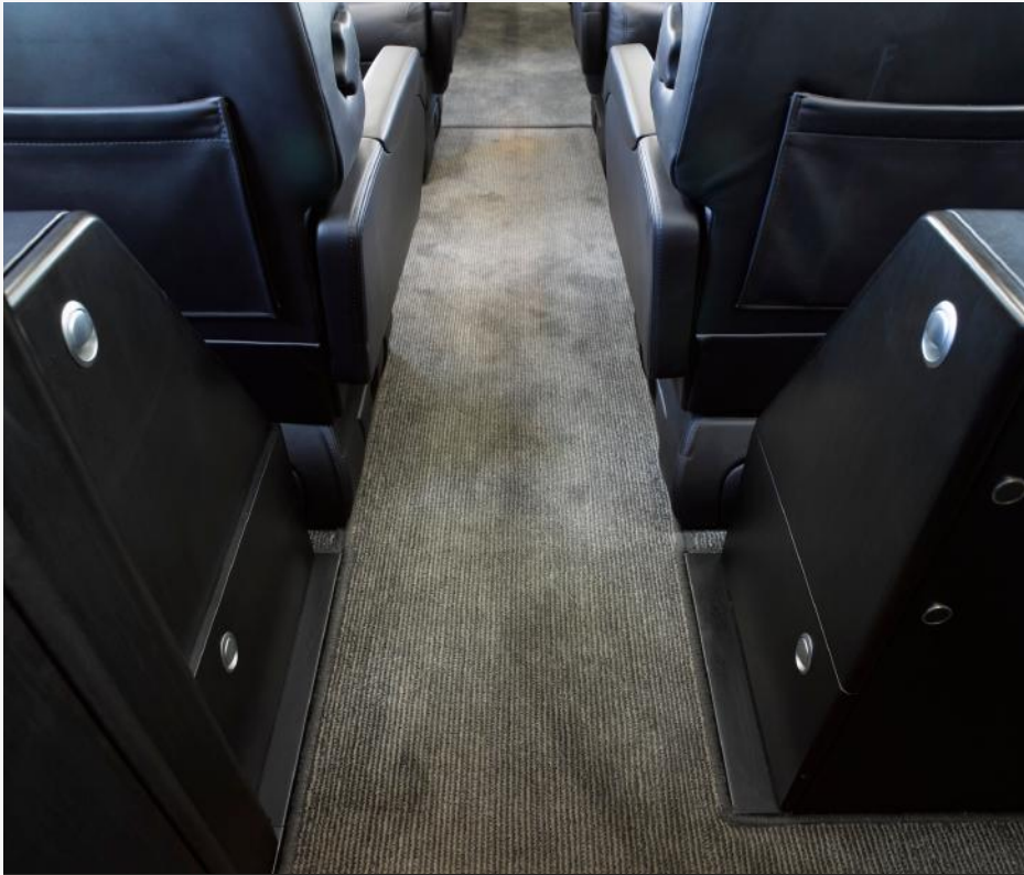
Fwd Refreshment Center (Closed)