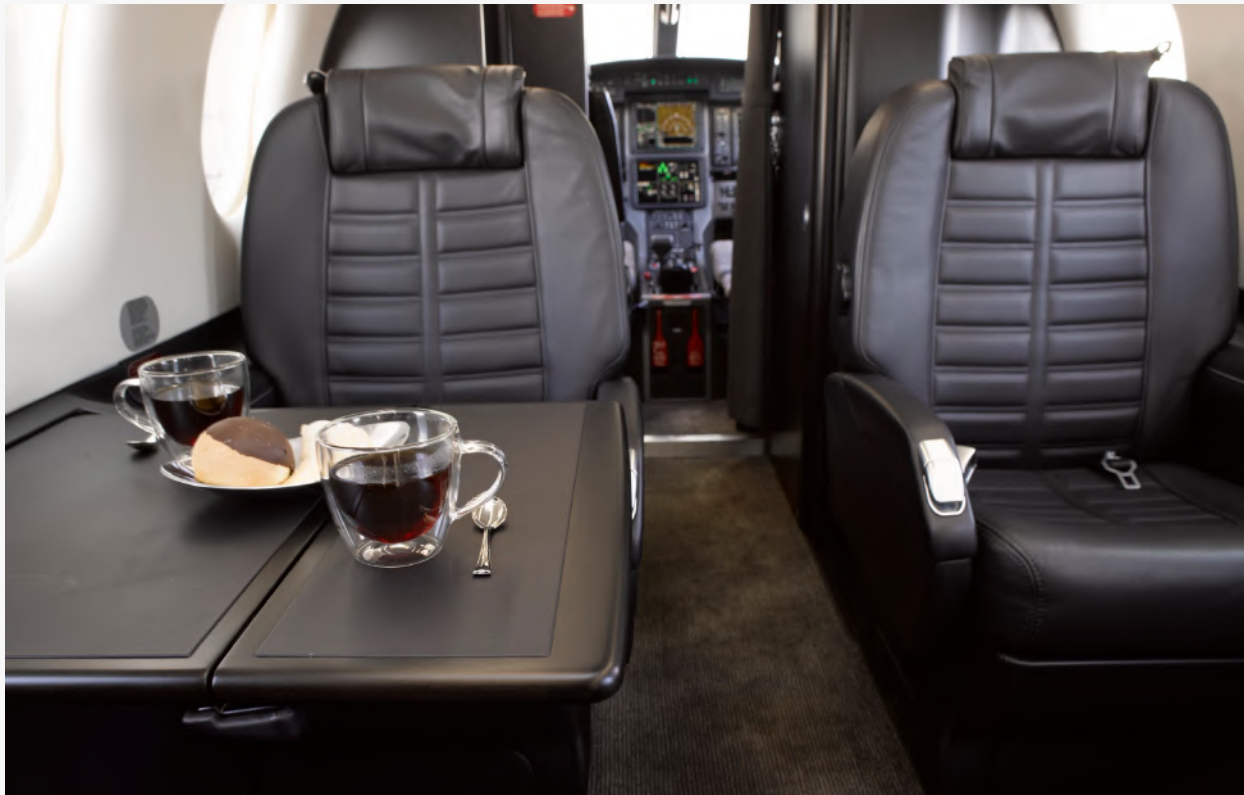
Fwd Four-Place Club Seats with One Table Extended