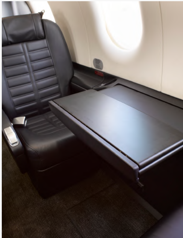
Four-Place Club Table (Partially Extended)