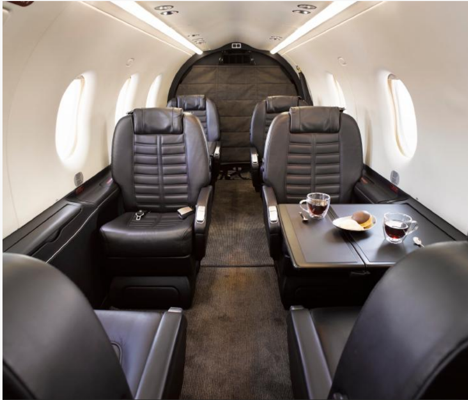
Fwd Cabin Facing Aft