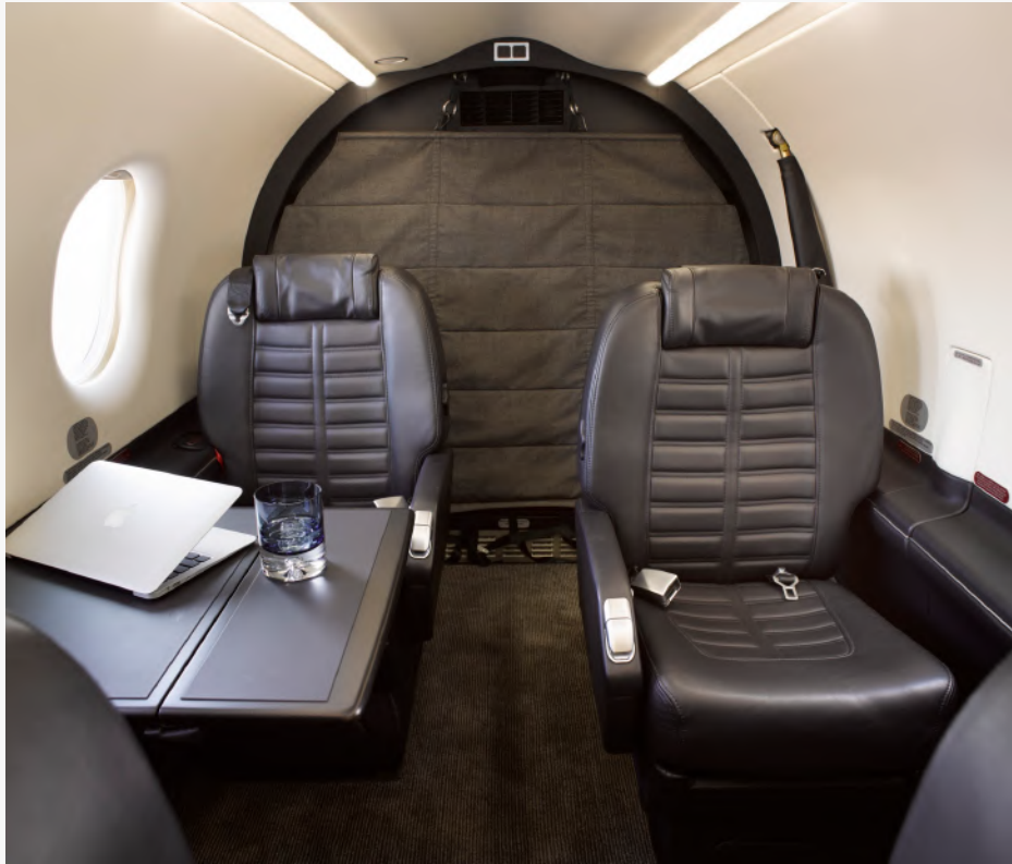
Aft Fwd-Facing Seats with Table Extended (Baggage Net in Background)