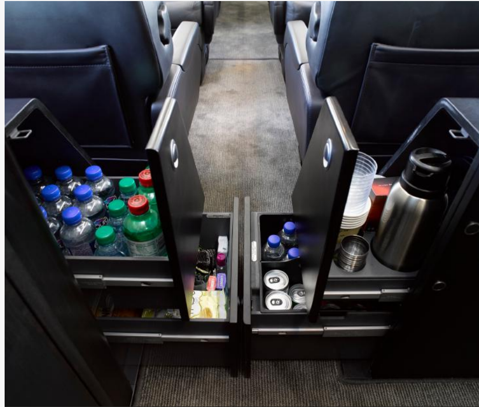
Fwd Refreshment Center (Open)