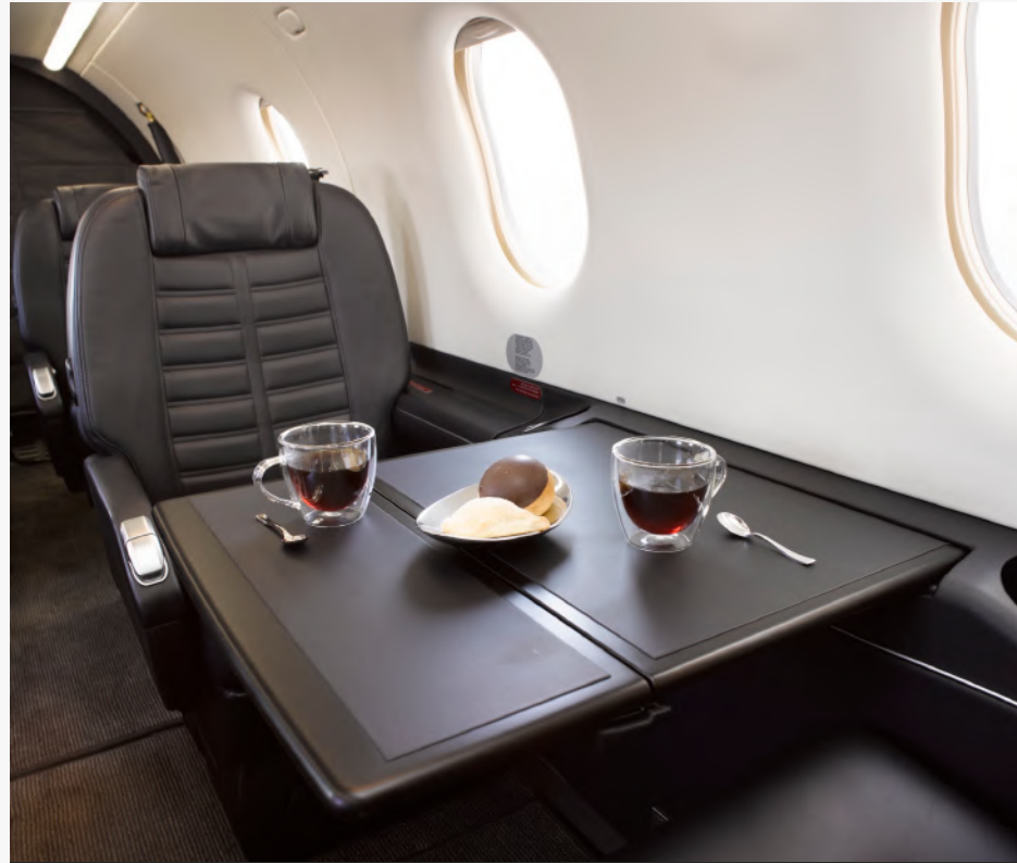
Four-Place Club Table Detail