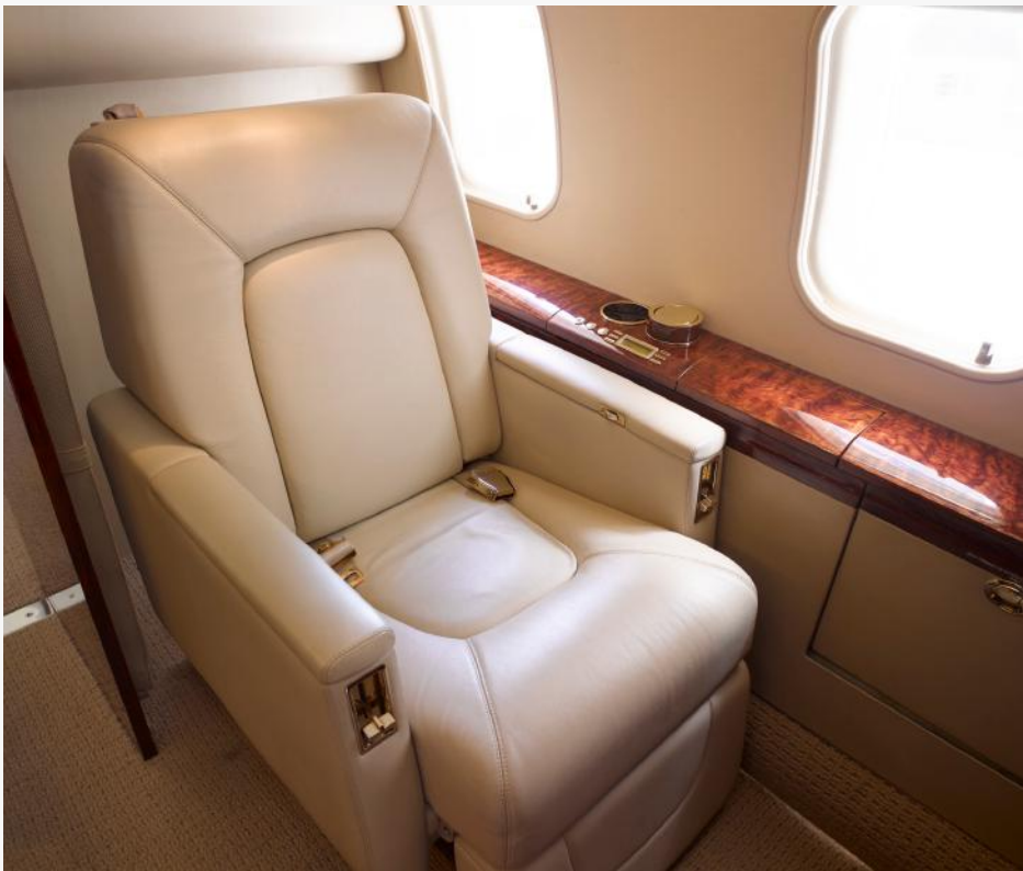
Fwd LS Enclosed Crew Rest Area Seat