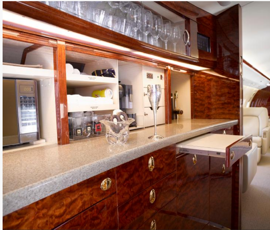
Forward RS Galley equipped with Oven, Microwave & Touchscreen Control