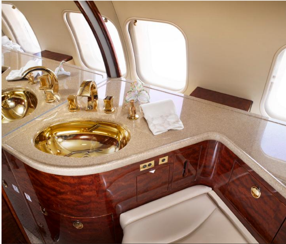
Aft Executive Lavatory