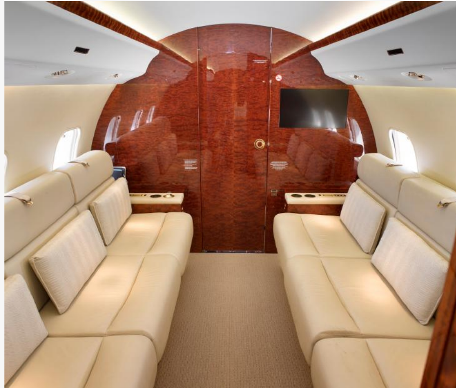
Aft Cabin Dual Three-Place Divans & Bulkhead Monitor