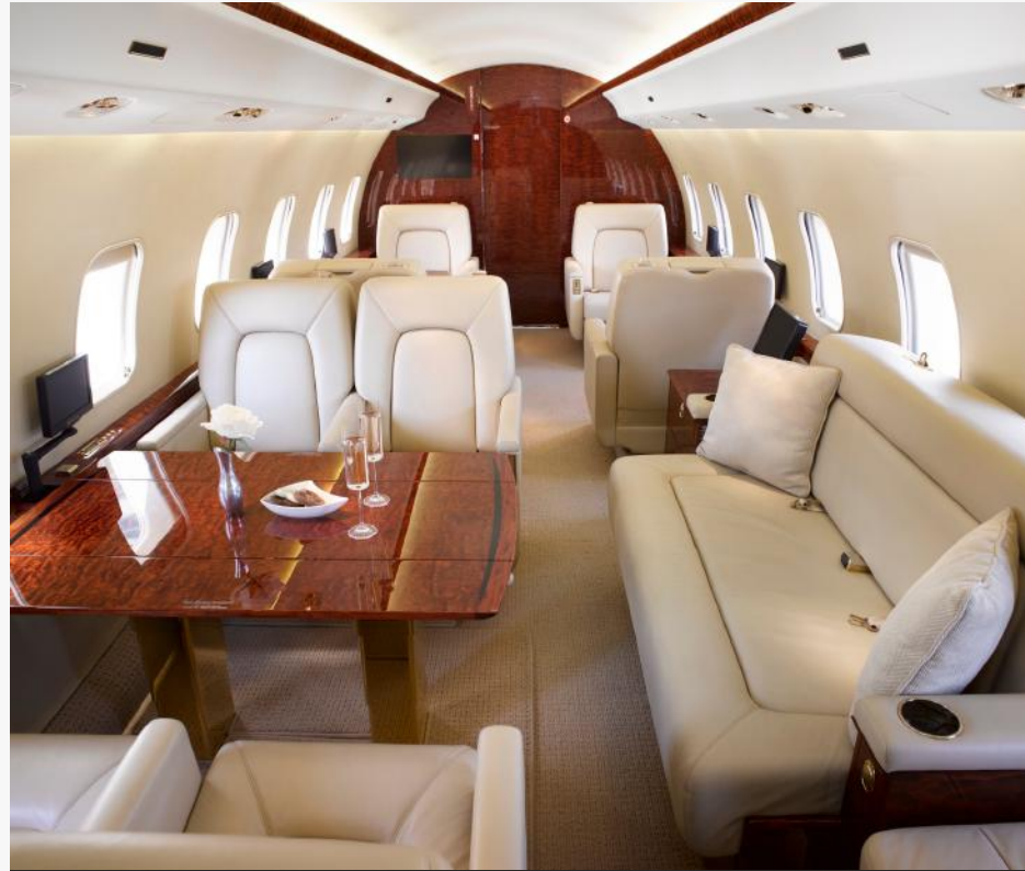
Mid Cabin Facing Forward (Four-Place Conference Group & Two-Place Divan)