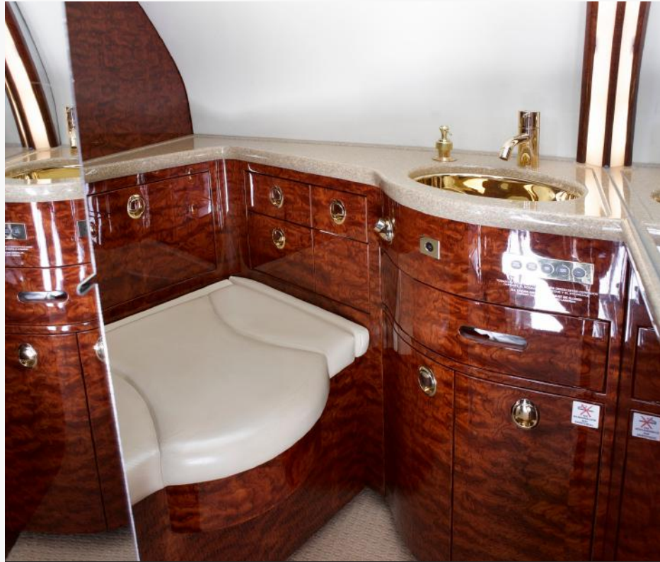
Forward RS Crew Lavatory