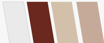
Displayed color swatches are an approximation