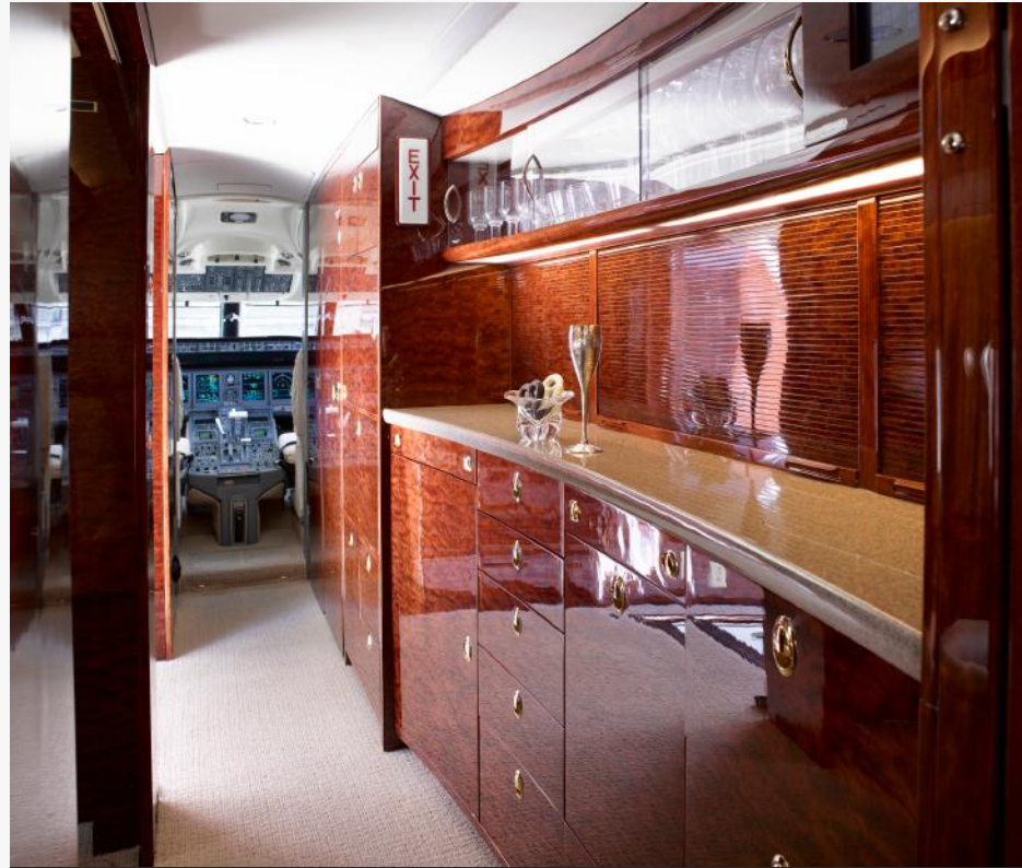
Galley & Crew Rest Area Looking Forward