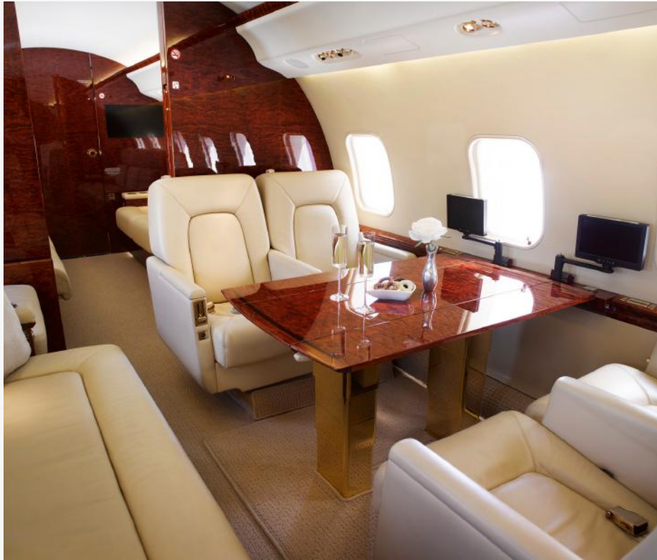
Mid Cabin Four-Place Conference Group with Two Personal Monitors