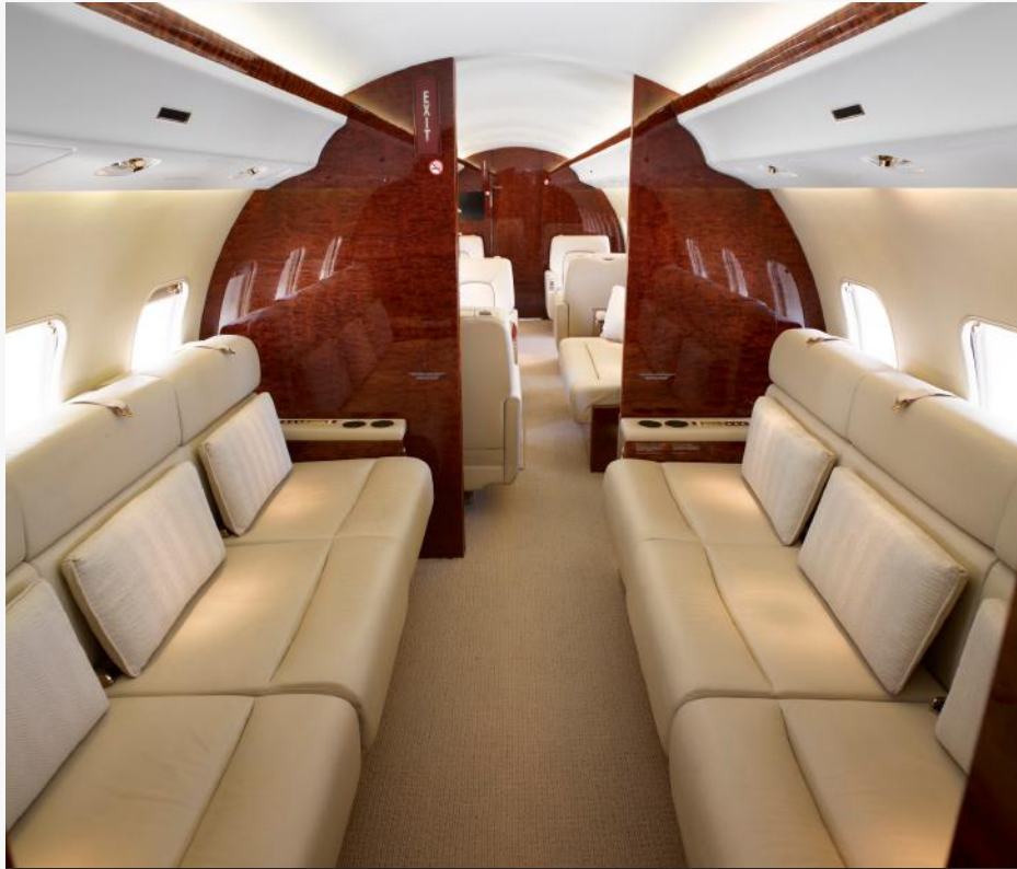
Aft Cabin Facing Forward (Dual Three-Place Divans)