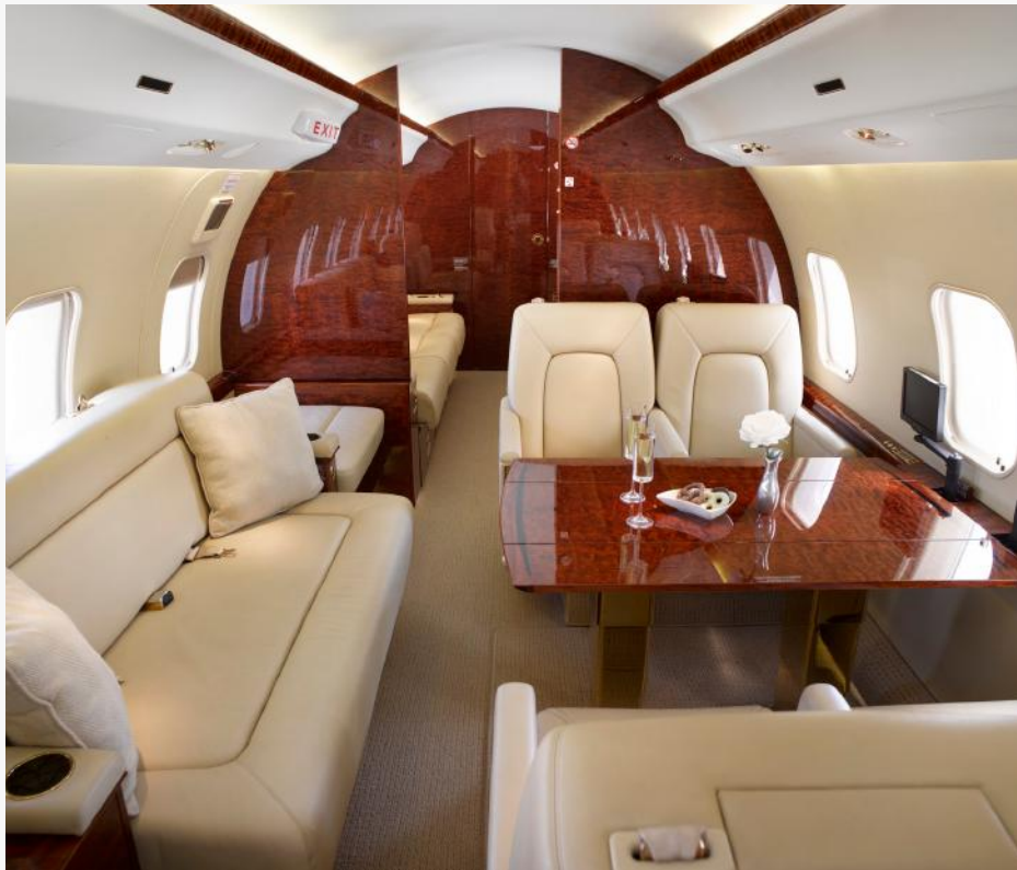
Mid Cabin Four-Place Conference Group & Two-Place Divan