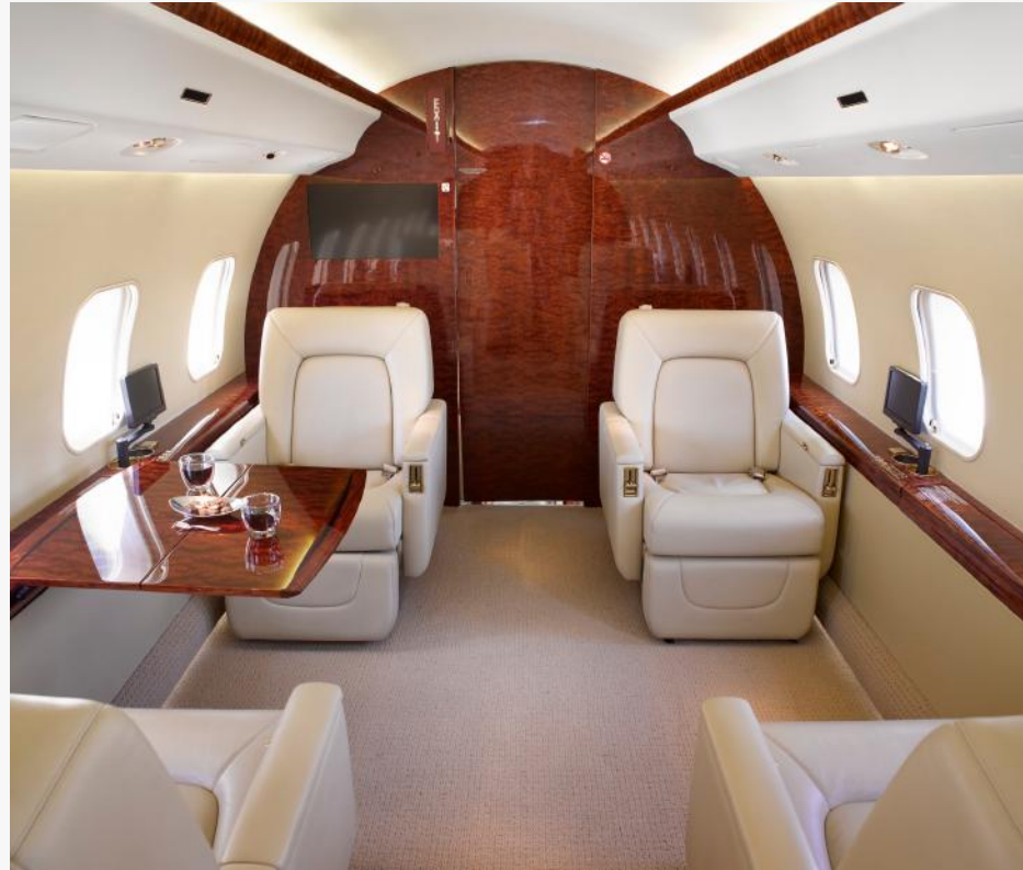
Fwd Cabin Facing Forward (Four-Place Club & Bulkhead Monitor)