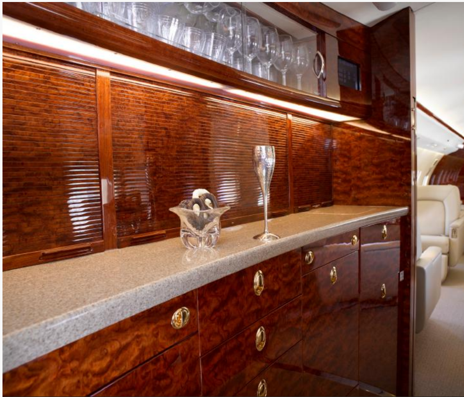
Forward RS Galley