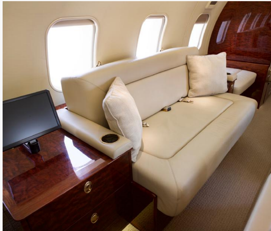
Mid Cabin Monitor & Two-Place Divan