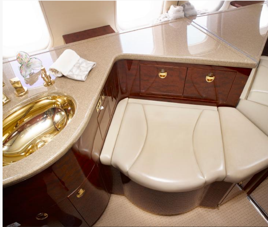
Aft Executive Lavatory