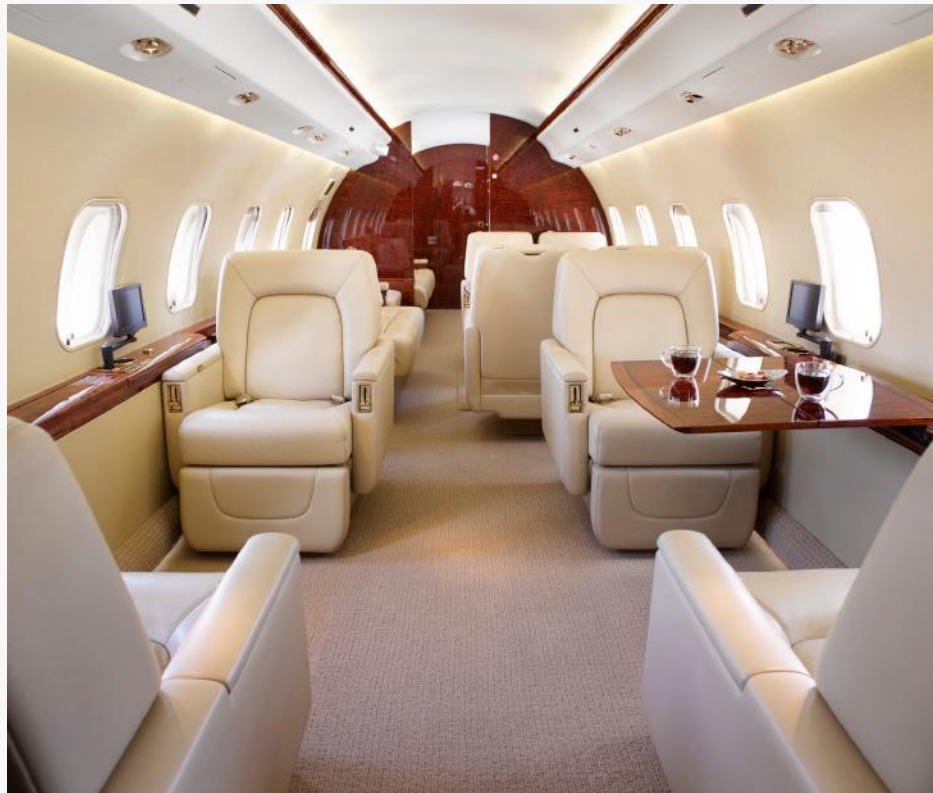
Fwd Cabin Four-Place Club with Four Personal Monitors