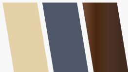
Displayed color swatches are an approximation