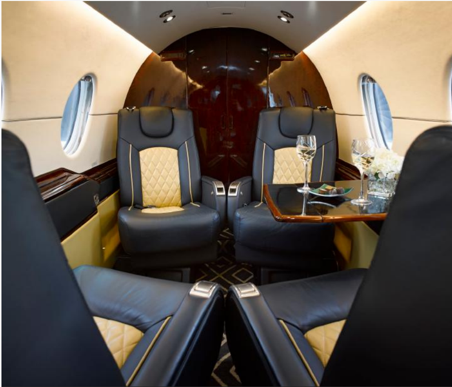
Aft Four Place Club