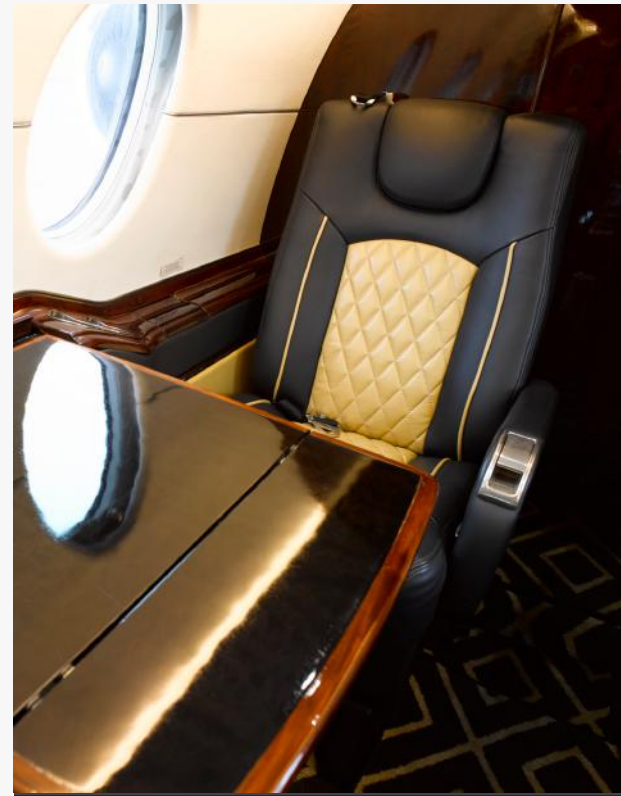
Aft Club Seat with Table