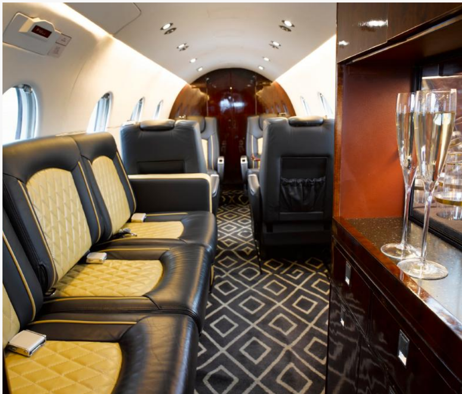
Fwd Three-Place Divan & Refreshment Center