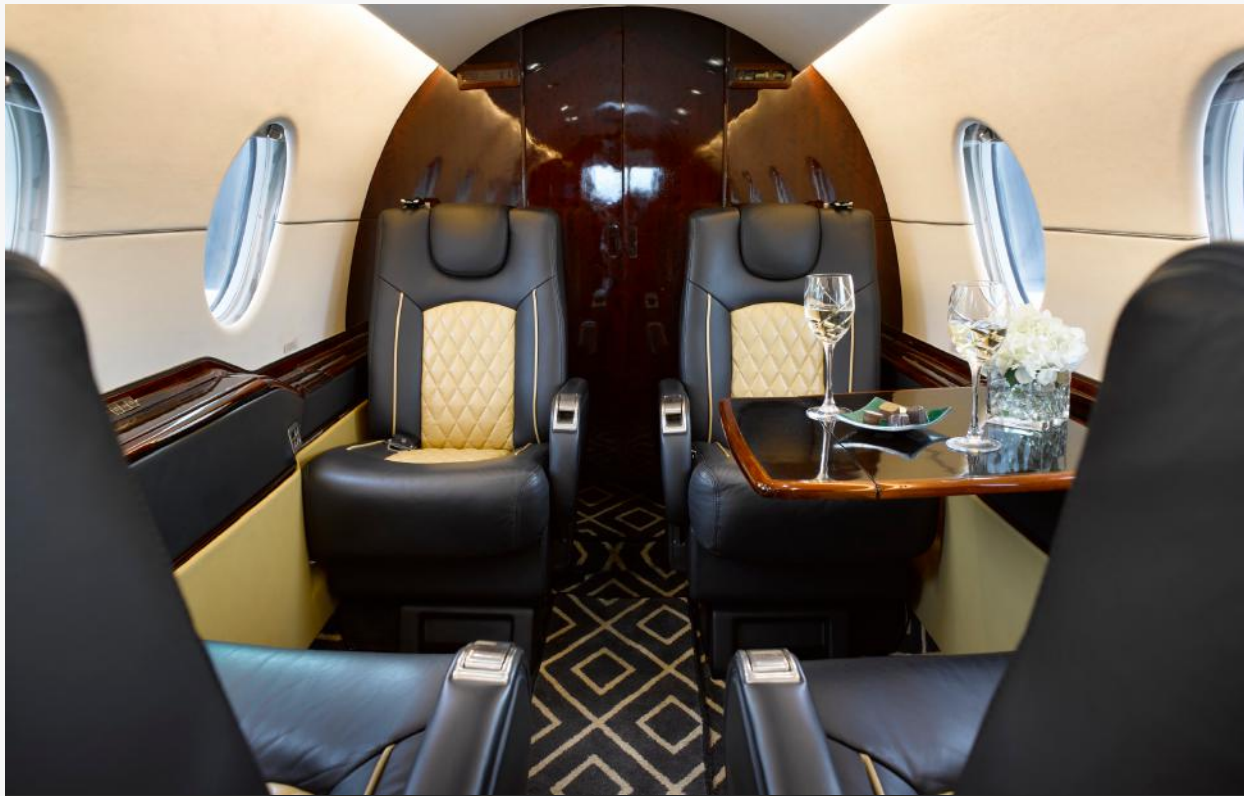
Aft Four Place Club