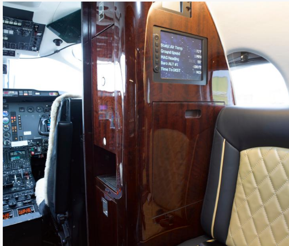
Fwd Refreshment Center & Storage