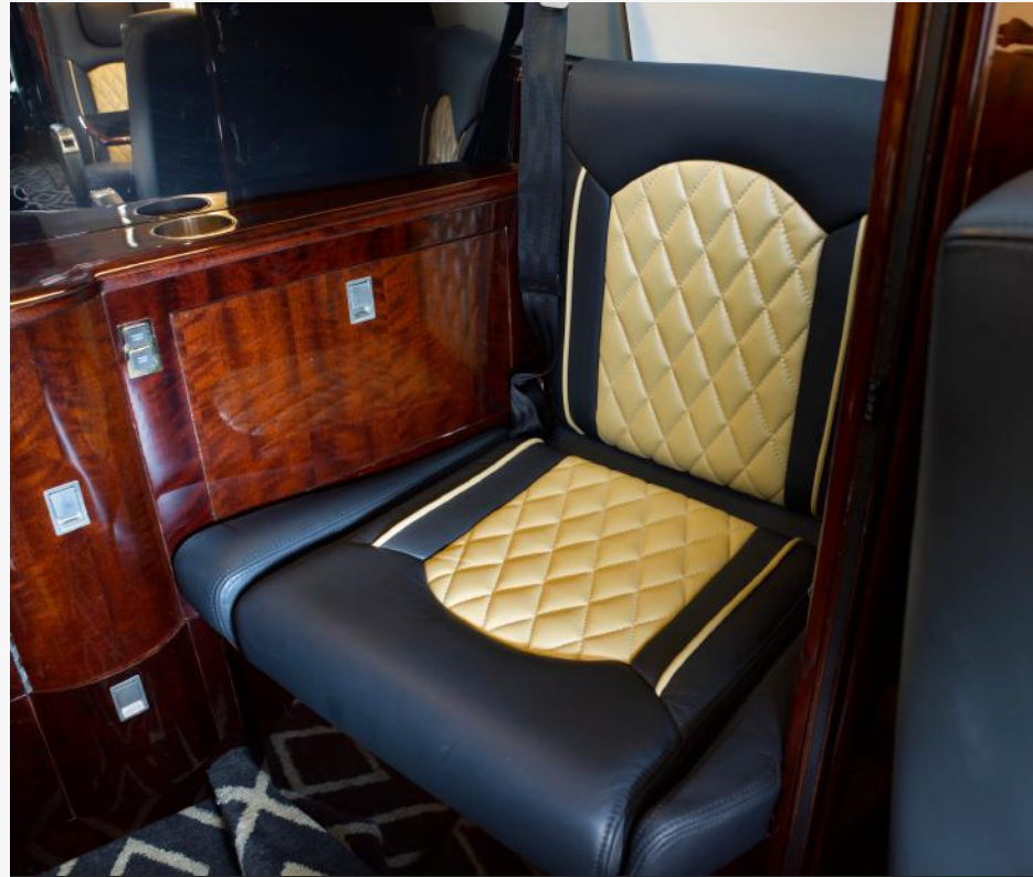
Belted Lavatory Seat