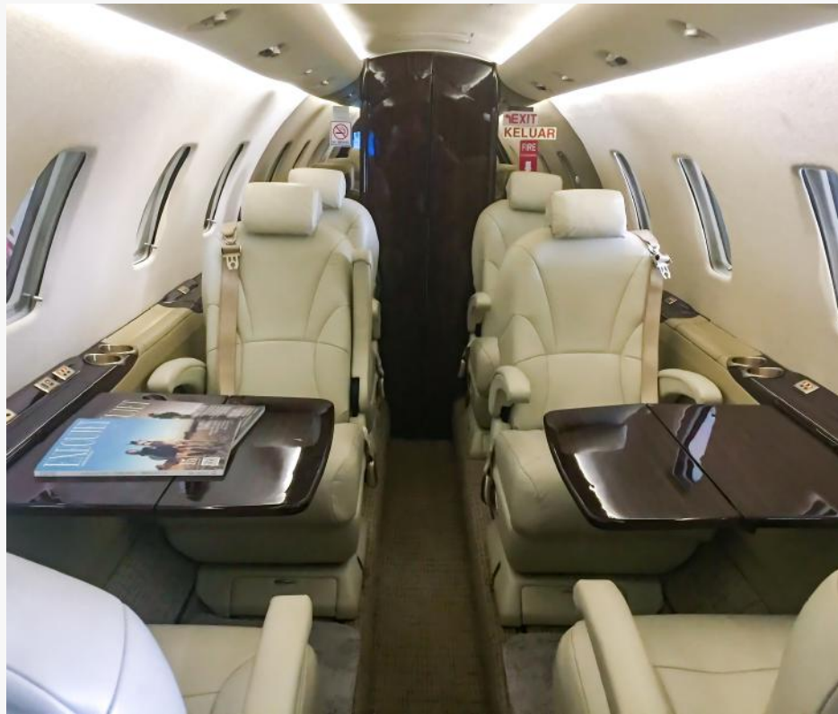
Executive Fold-Out Tables