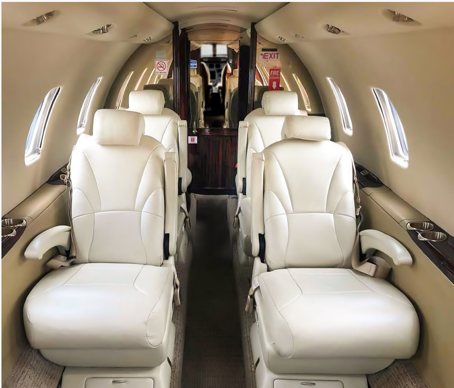
Forward Cabin Facing Aft