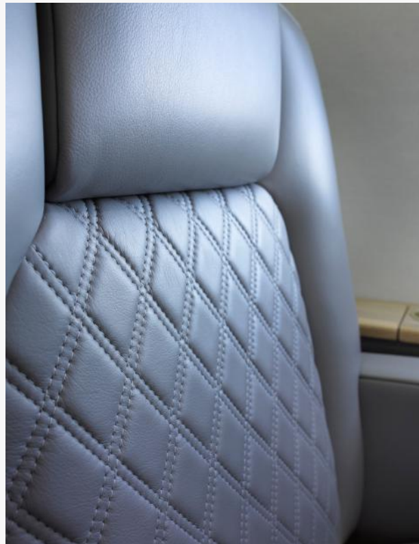
Club Seat Stitching Detail