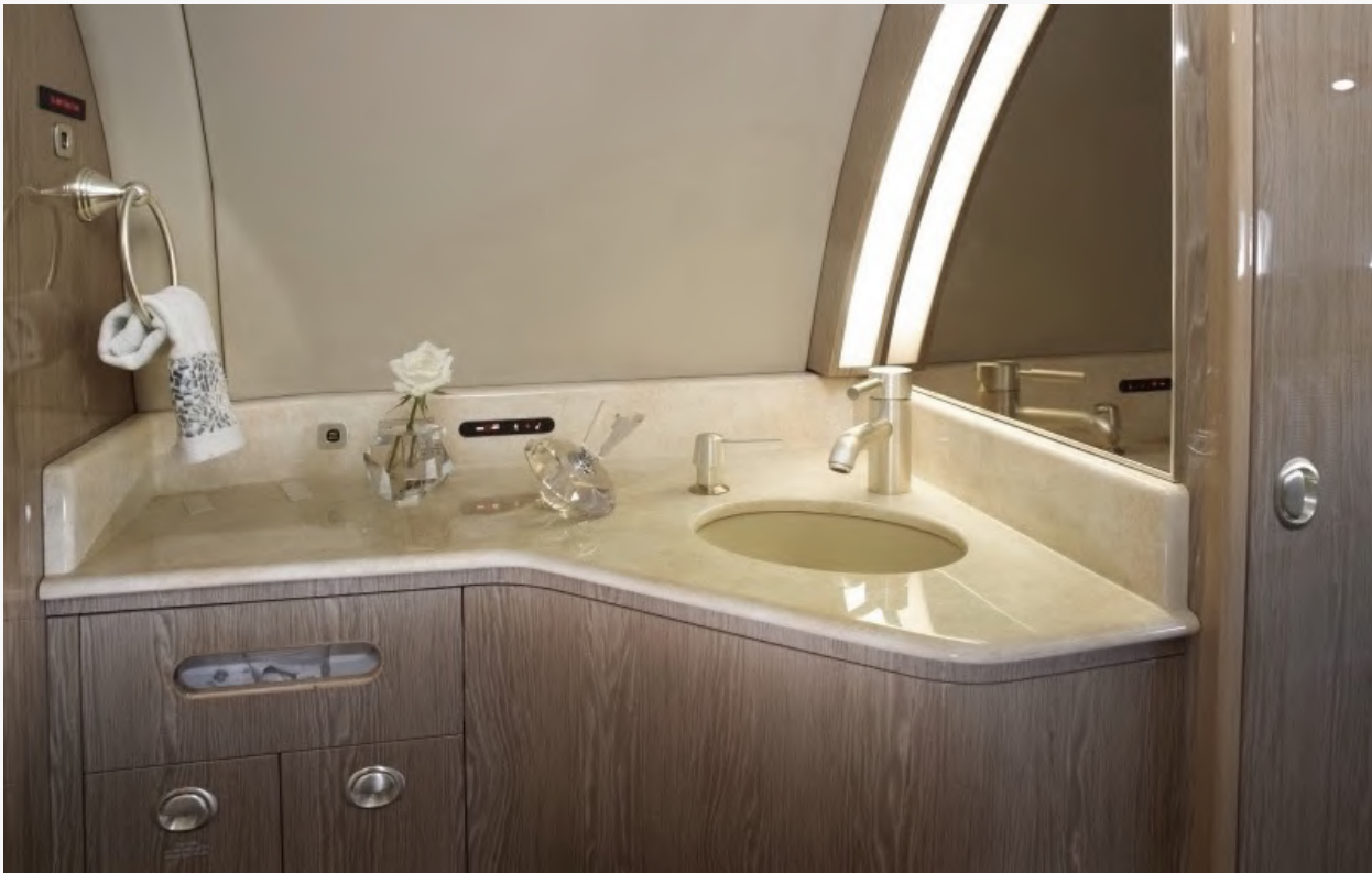
Aft Lavatory Sink and Storage