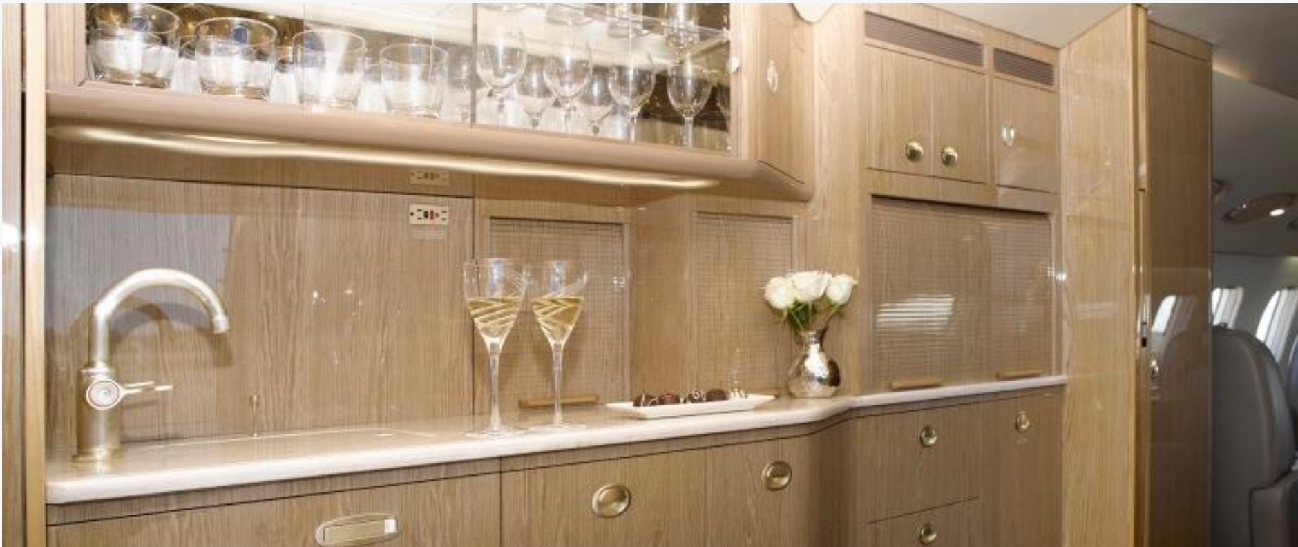
Forward Galley and Storage