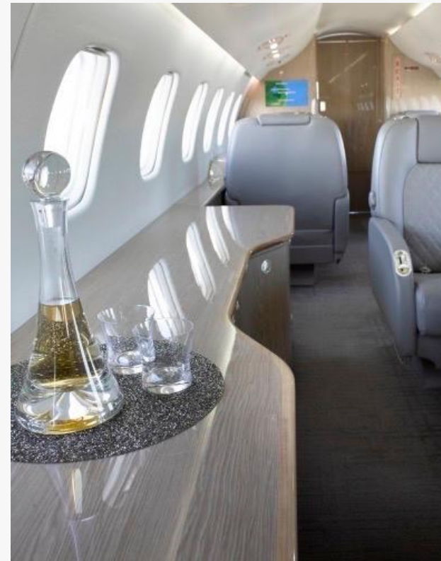
Mid Cabin Credenza Woodgrain Looking Forward