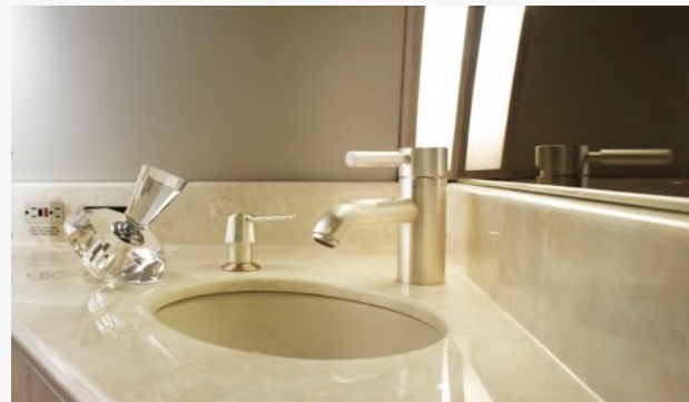
Aft Lavatory Sink