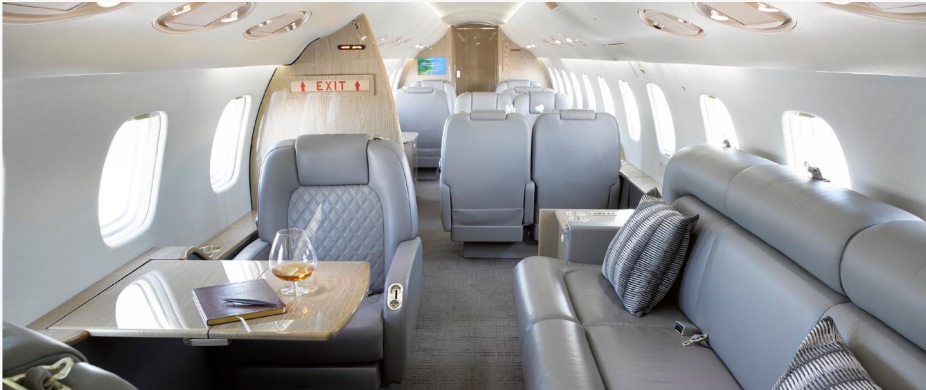
Aft Cabin Dual Club Seat and Divan Looking Forward