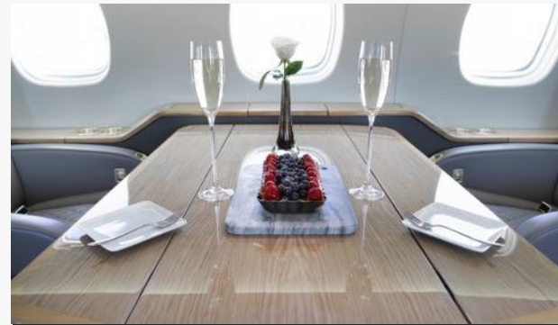
Mid Cabin Conference Group Table