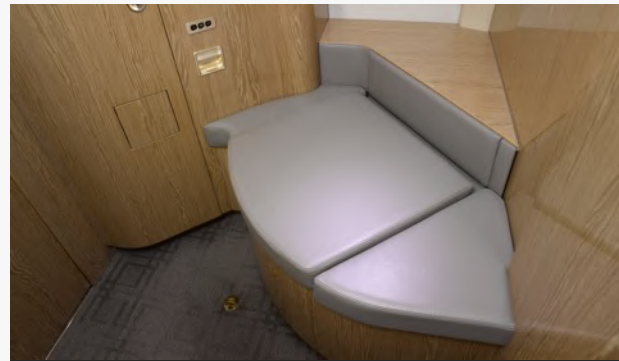
Aft Lavatory Seat