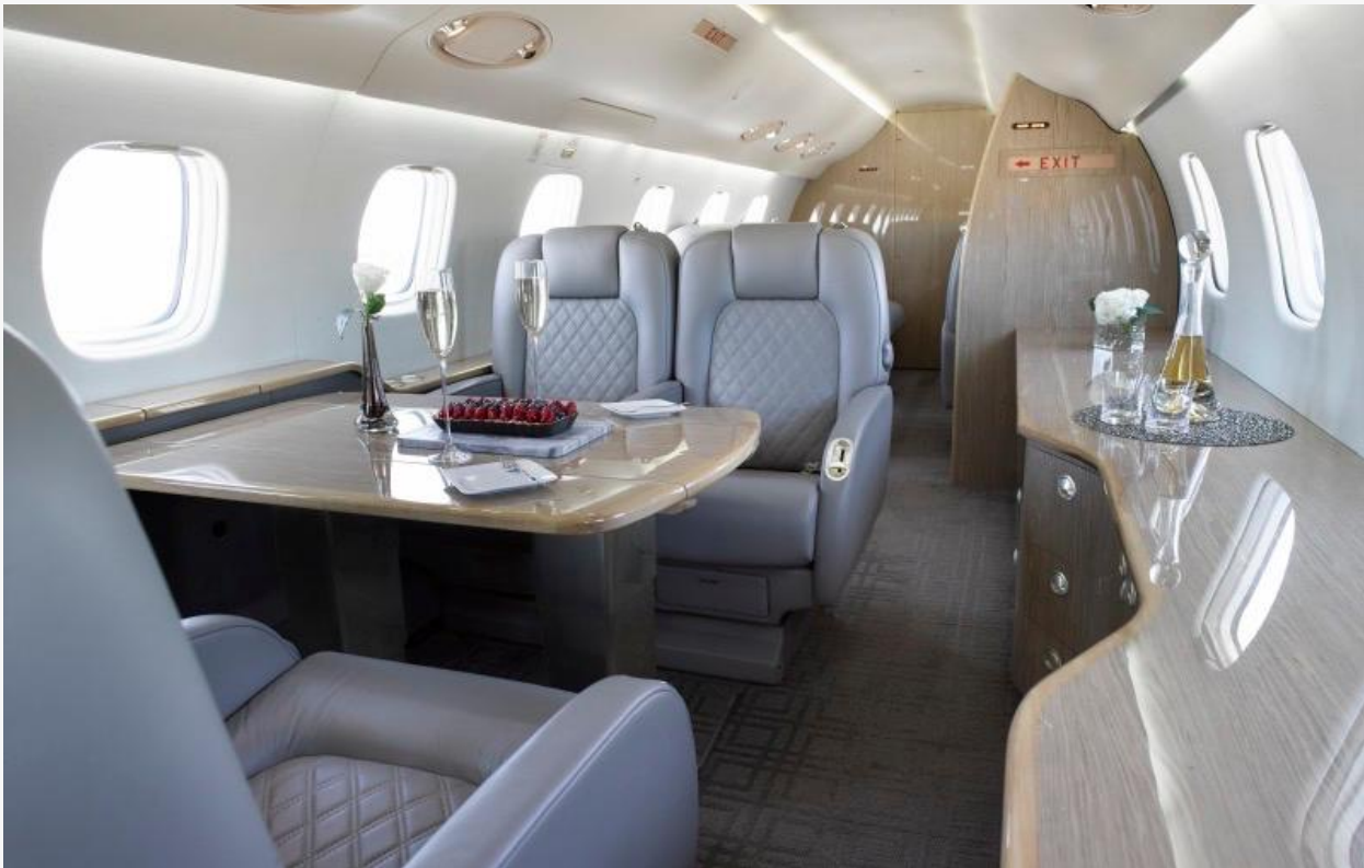
Mid Cabin Conference Group and Credenza Looking Aft