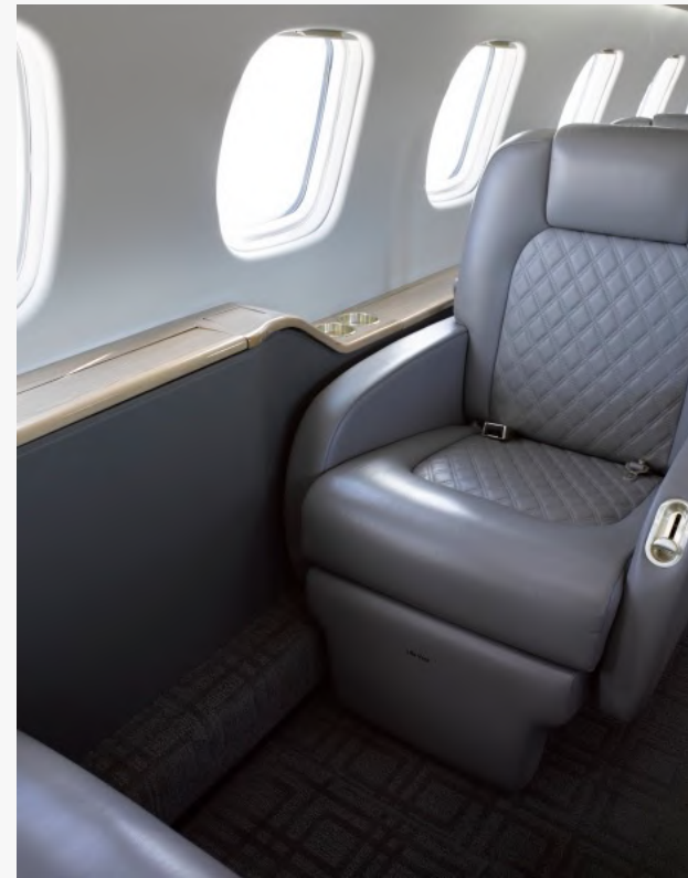
Forward Cabin Club Seat