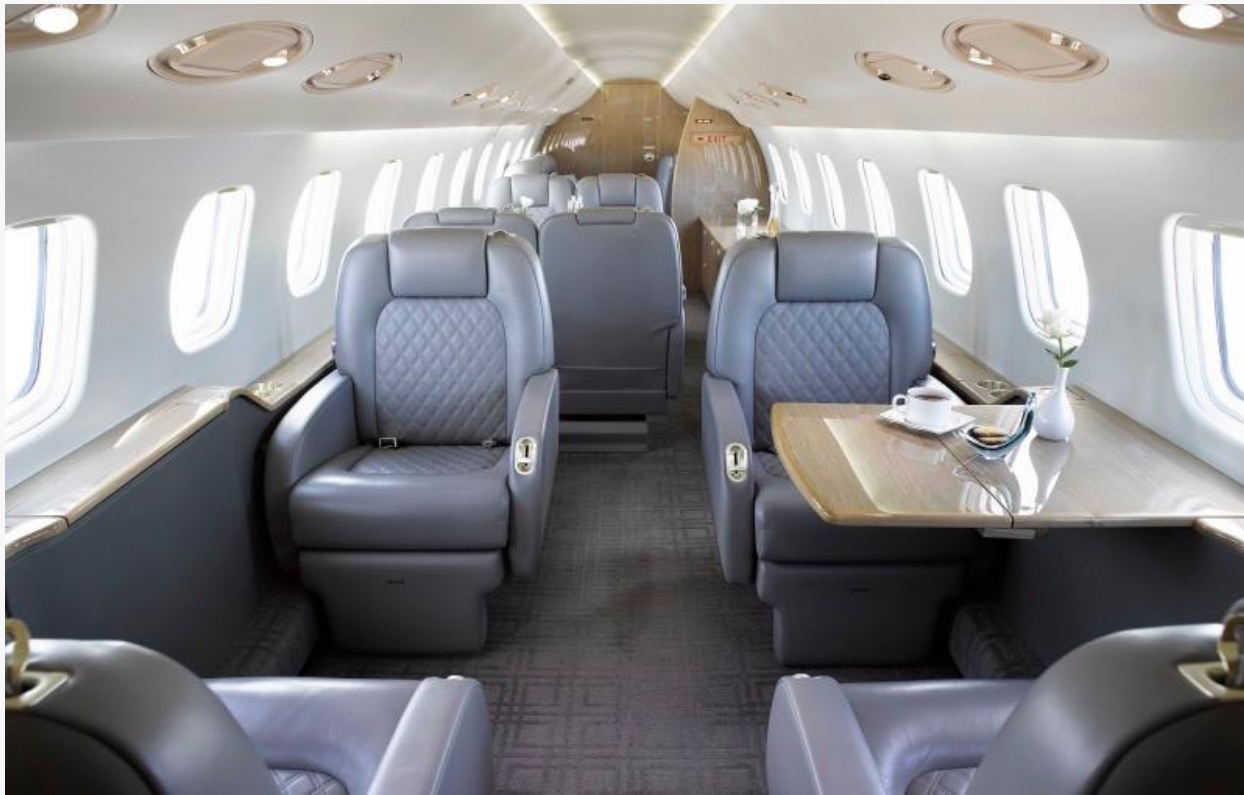
Forward Cabin Four Place Club Seating Looking Aft