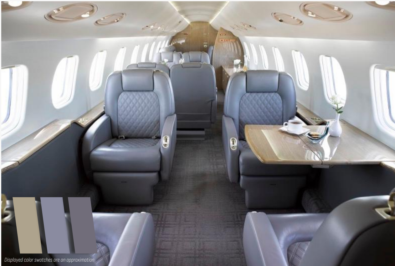
Displayed color swatches are an approximation