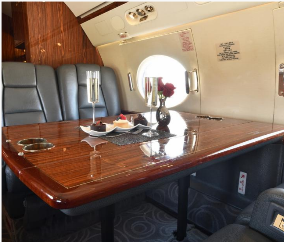
Aft Cabin Conference Group