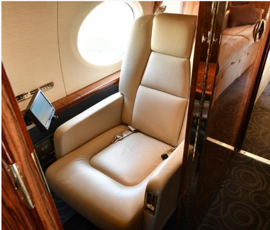
Forward Crew Rest