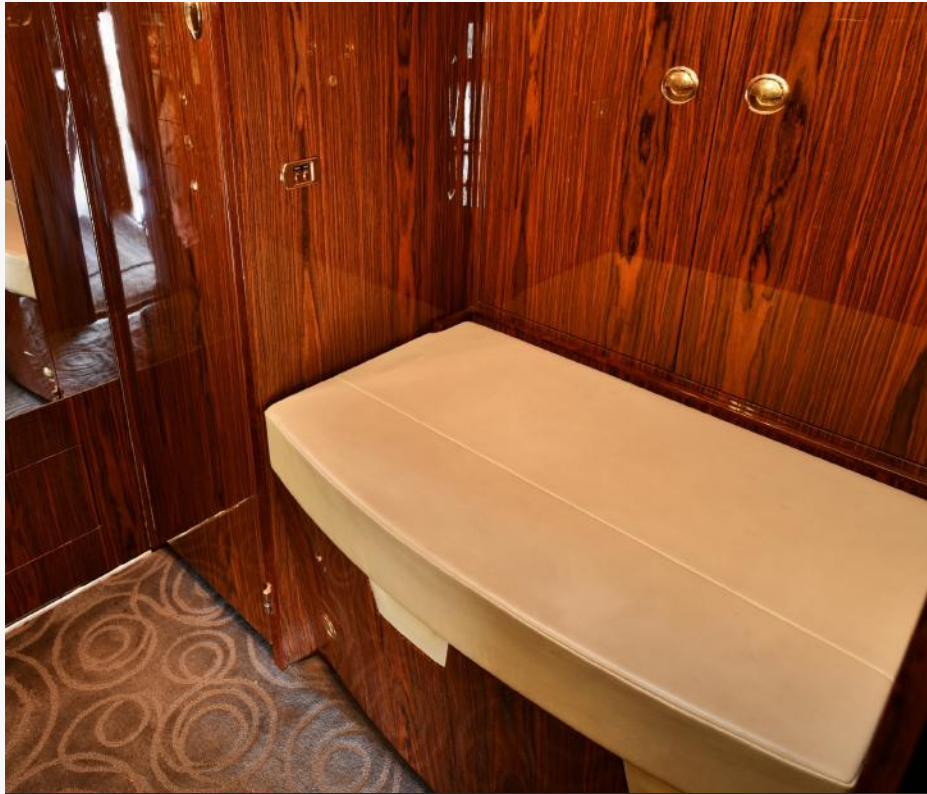
Aft Lavatory and Storage