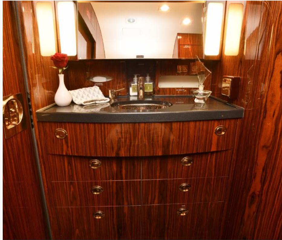
Aft Lavatory and Storage