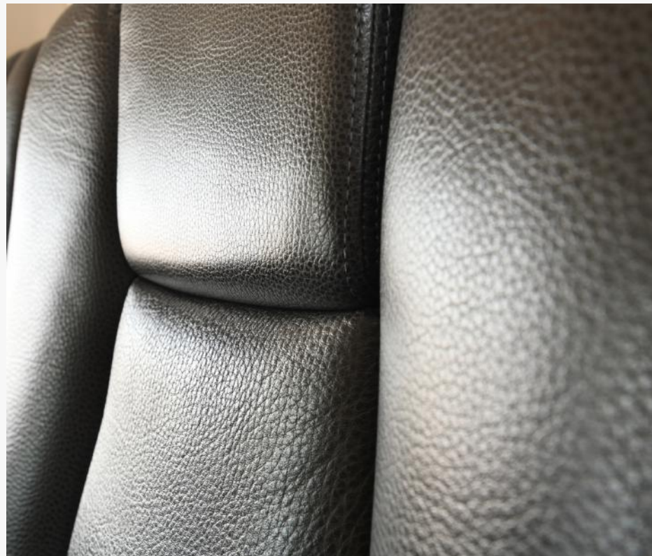
Aft Cabin Conference Group Seat