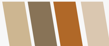
Displayed color swatches are an approximation