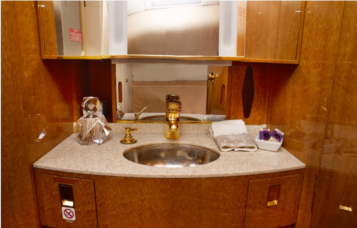
Aft Lav Vanity