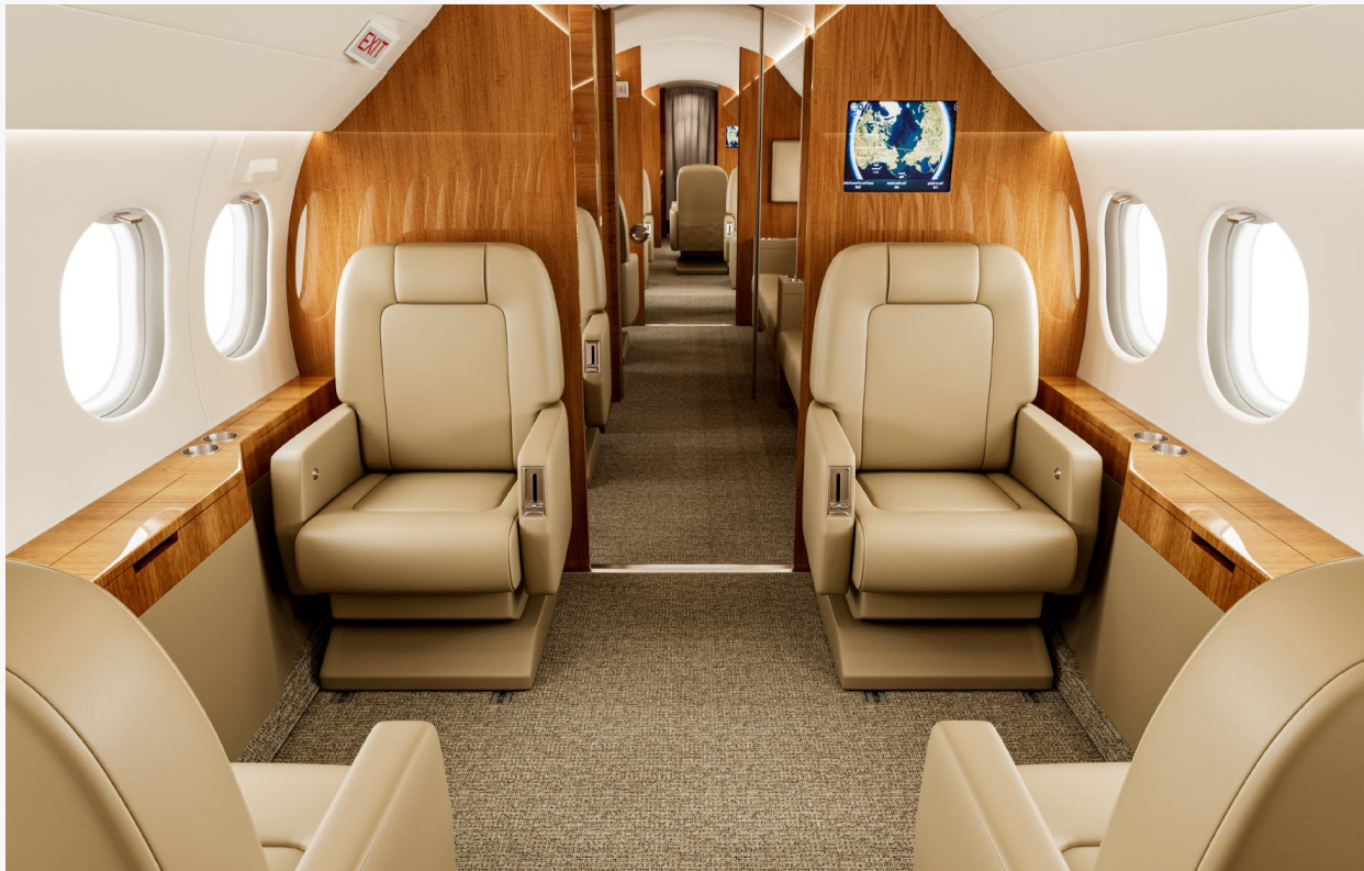
Rendering of Mid Cabin Four (4)-Place Club Looking Aft