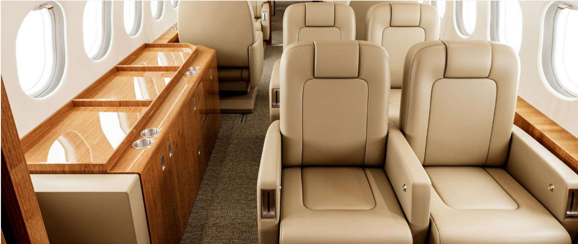
Rendering of Forward Cabin Seating Looking Aft