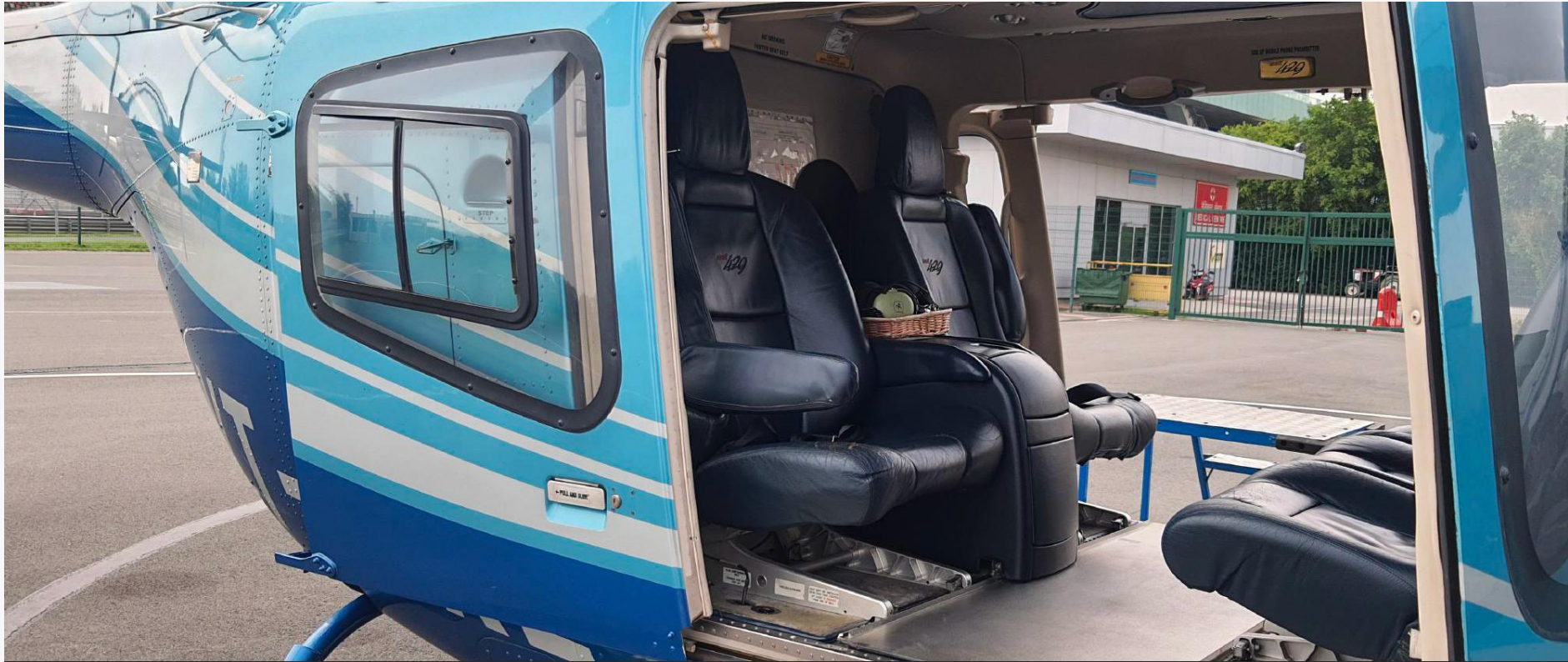
Two (2) Fwd-Facing Seats